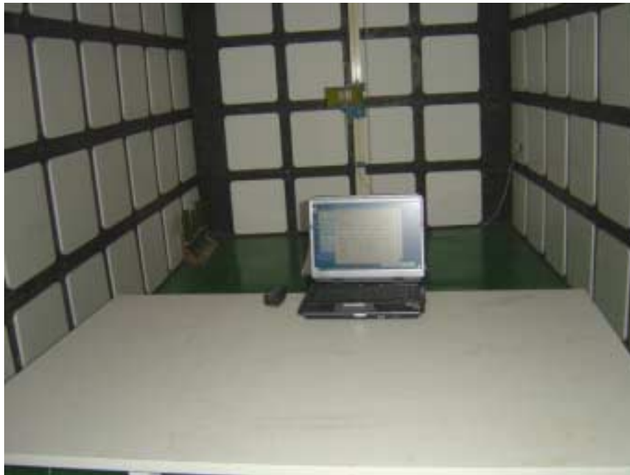
9.3.Photo of 6dB Bandwidth Measurement