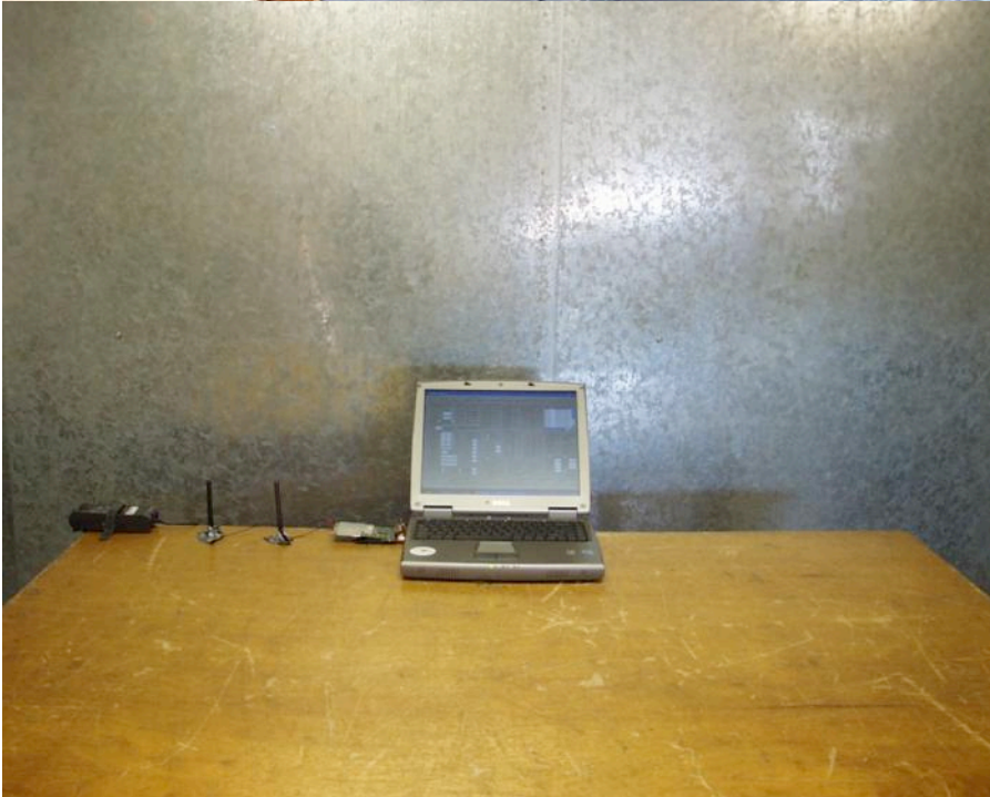
AC Line Conducted