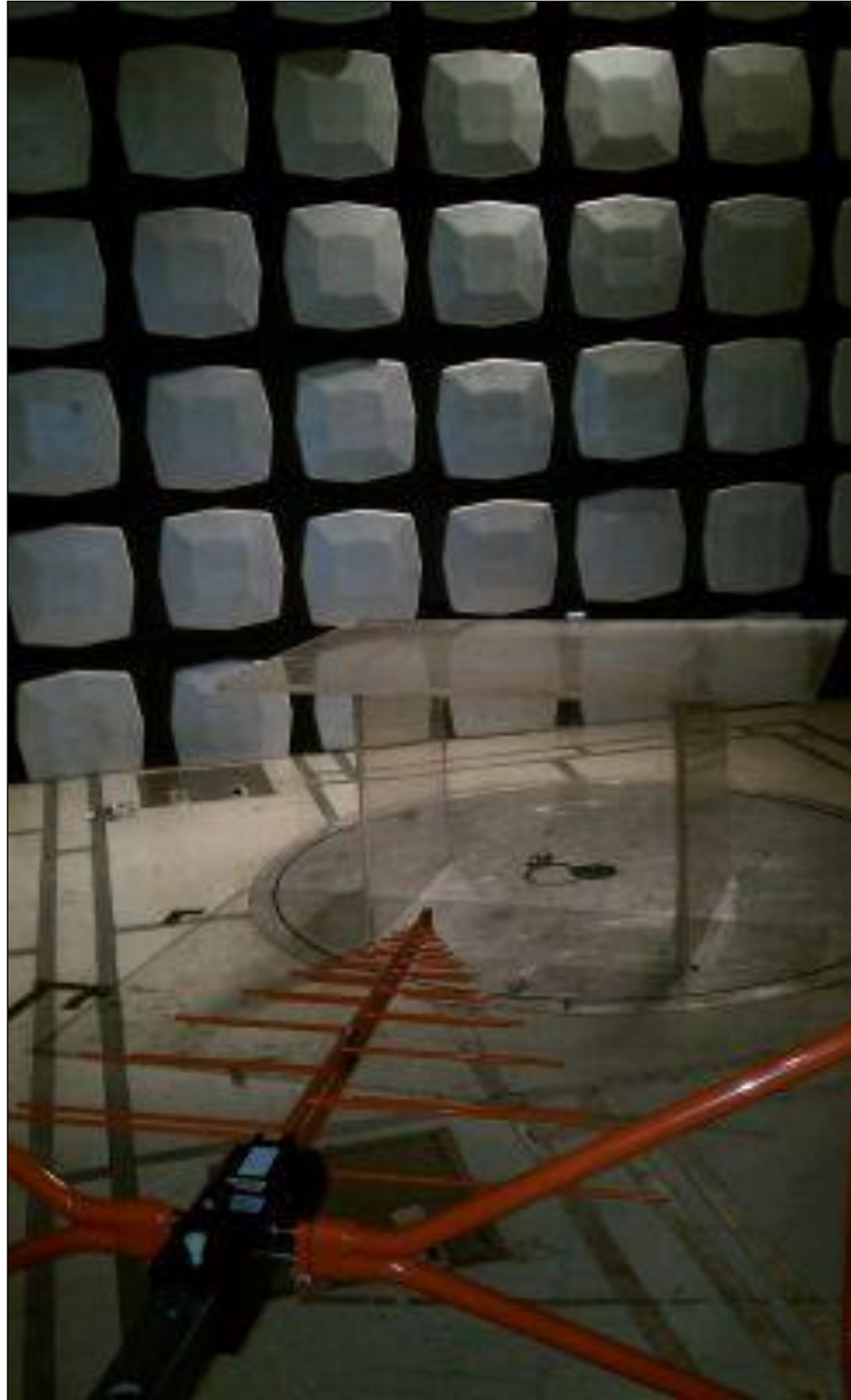
Photograph 1. Radiated Emissions, Test Setup, 30 MHz – 1 GHz