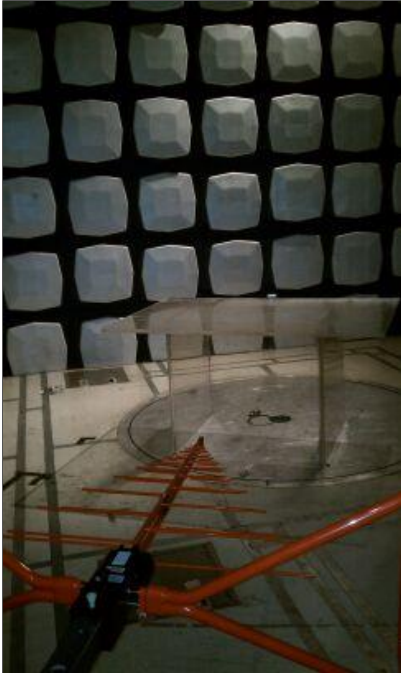
Photograph 2. Radiated Spurious Emissions, Test Setup, 30 MHz – 1 GHz