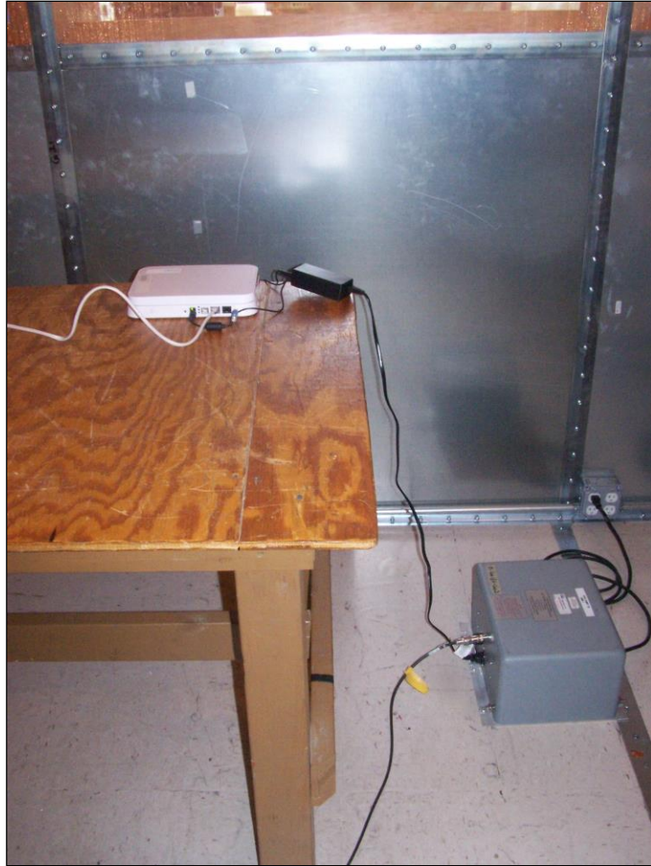
Photograph 3. Conducted Emissions, 15.207(a), Test Setup