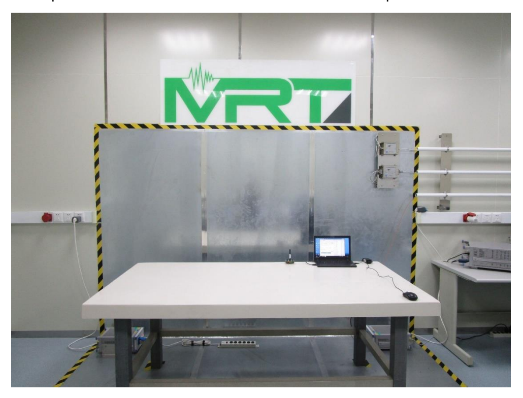
Test Mode 1 Description: Back View of Conducted Emission Test Setup

Description: Front View of Conducted Emission Test Setup