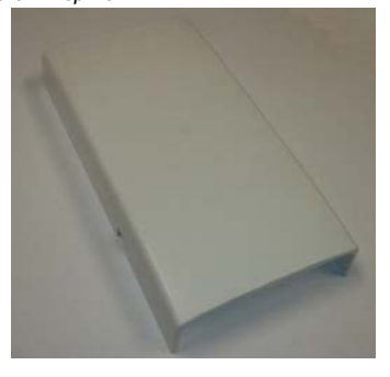
Figure 1: Top view