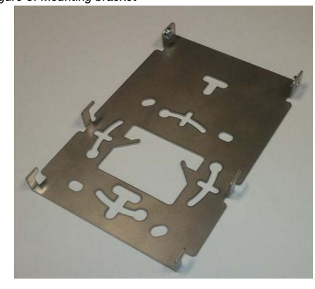
Figure 3: Mounting bracket

1 Use either the original wall outlet box screws or the factory-supplied 1" Phillips pan head machine screws to attach the H500 mounting bracket to a single-gang wall outlet box.