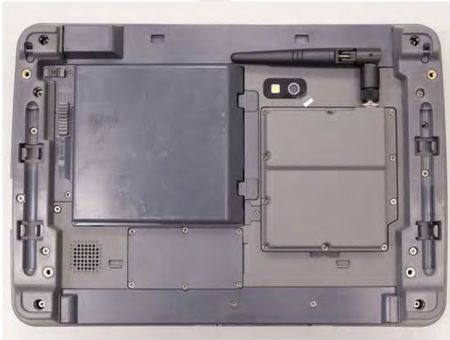
Fig.18 Back view of EUT with bumper / optional battery / transceiver