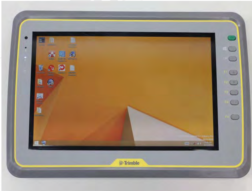
Fig.14 Front view of EUT