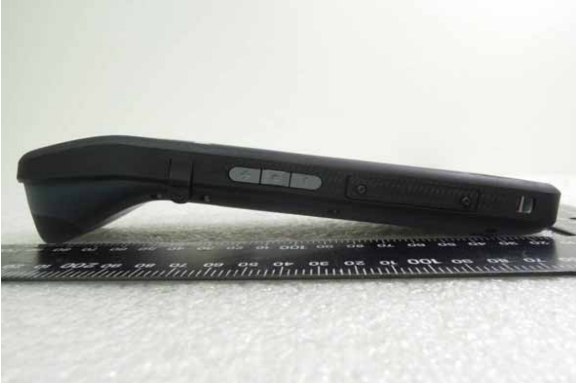
Side View of EUT – 5