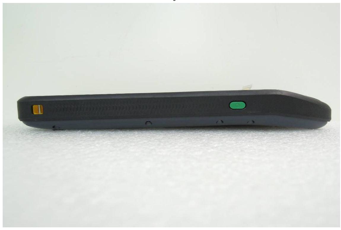
Side View of EUT - 3