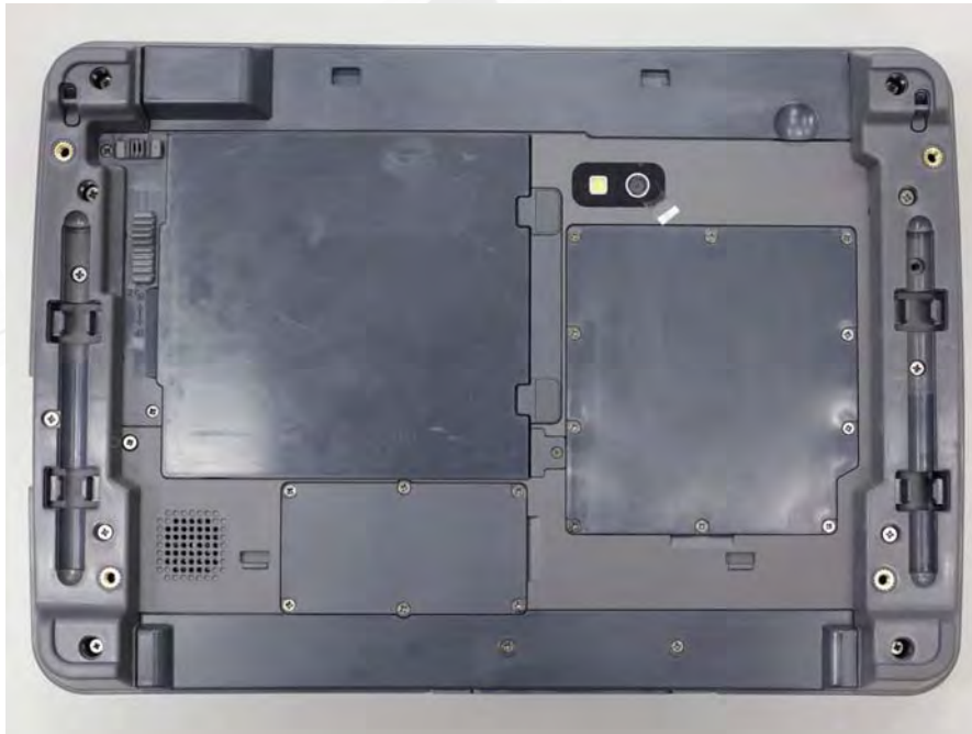
Fig.16 Back view of EUT with bumper (With left/right/GPS bumper attached)