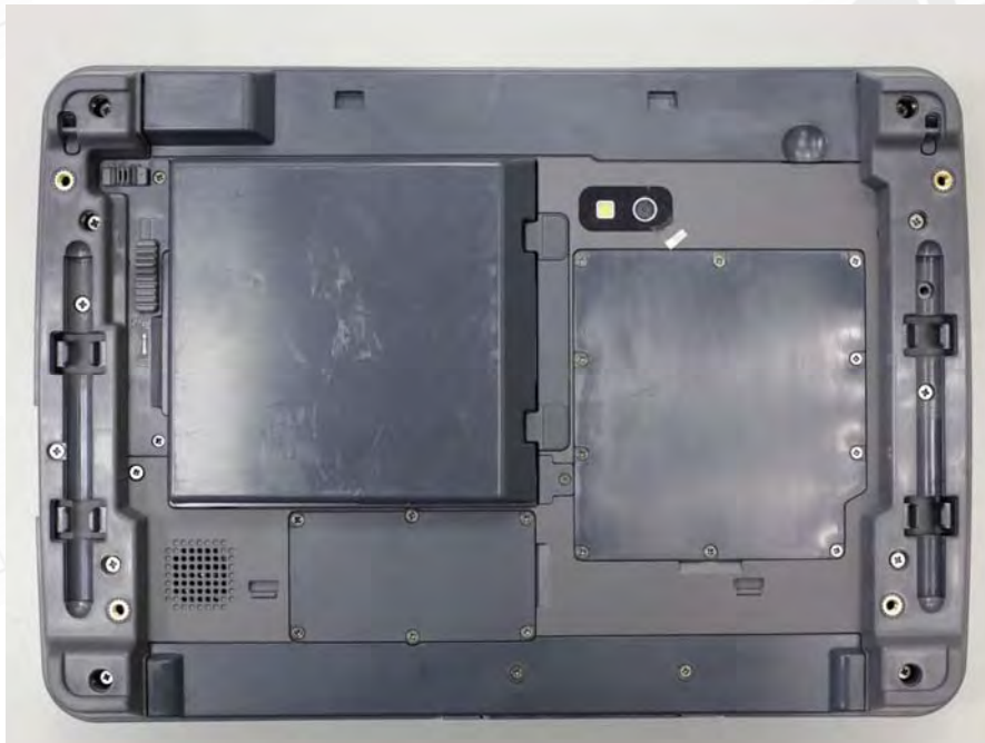
Fig.17 Back view of EUT with bumper and optional battery

Unless otherwise stated the results shown in this test report refer only to the sample(s) tested and such sample(s) are retained for 90 days only.