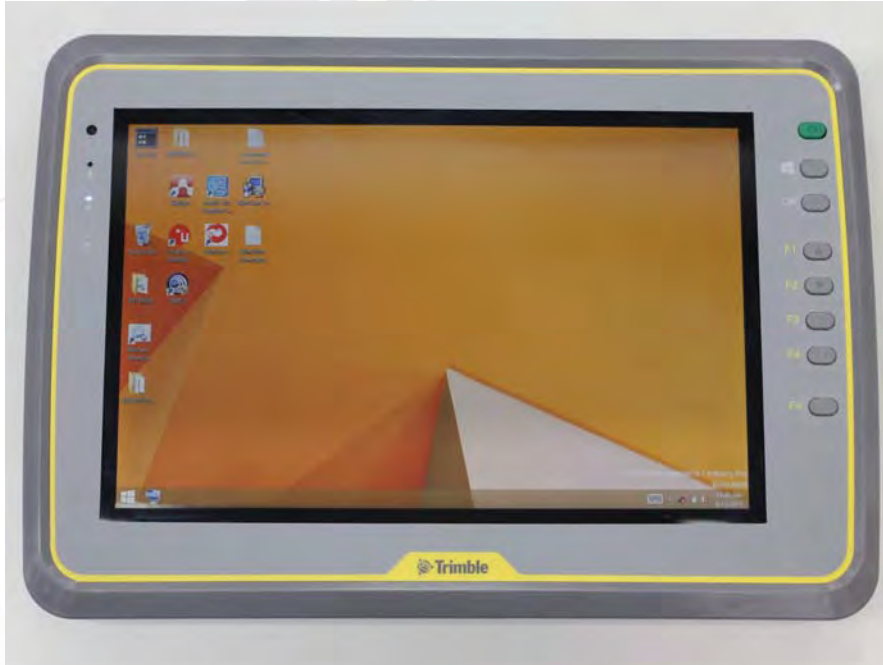
Fig.14 Front view of EUT