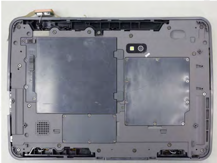
Fig.15 Back view of EUT (Remove left/right bumper and unload GPS cover)

Unless otherwise stated the results shown in this test report refer only to the sample(s) tested and such sample(s) are retained for 90 days only.