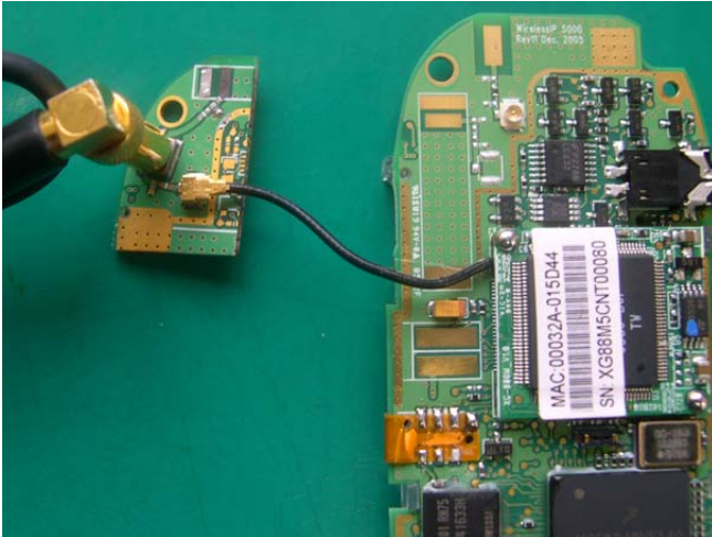
Connection of the antenna port to RF cable