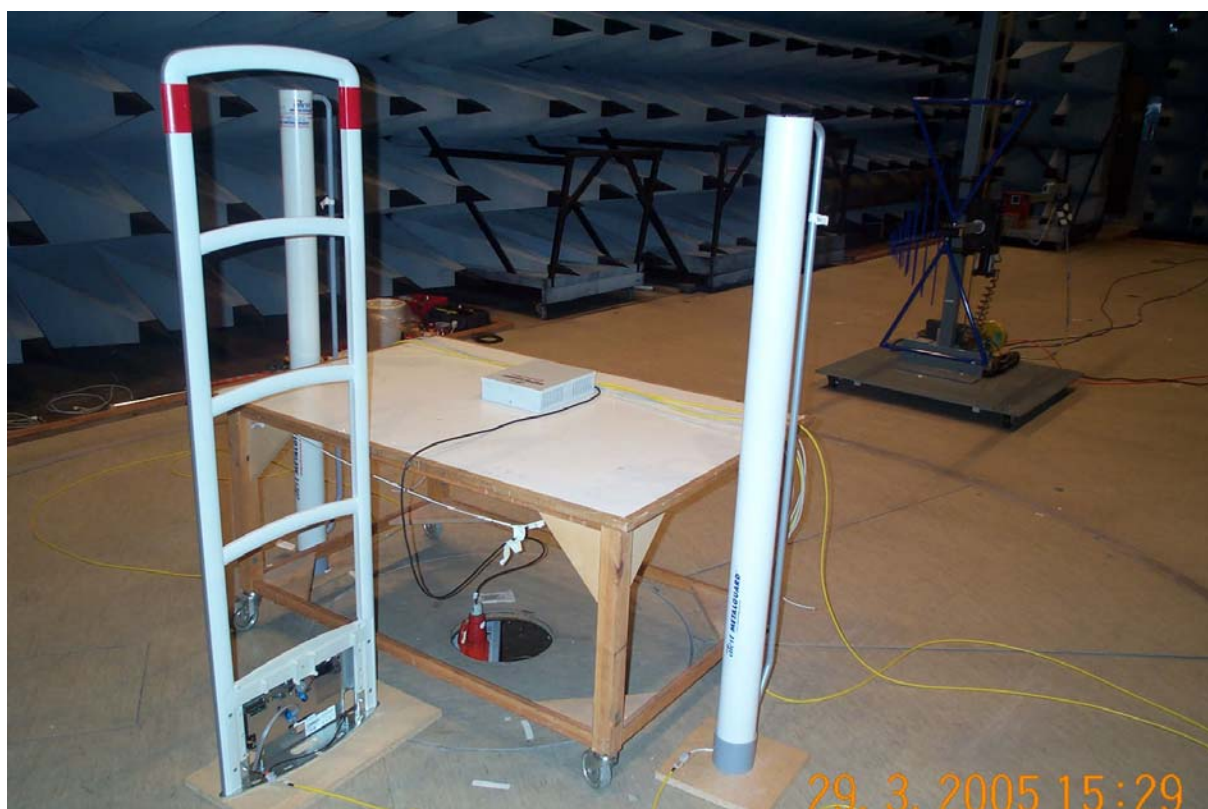
Photo 2 Radiated emission 30-1000 MHz.