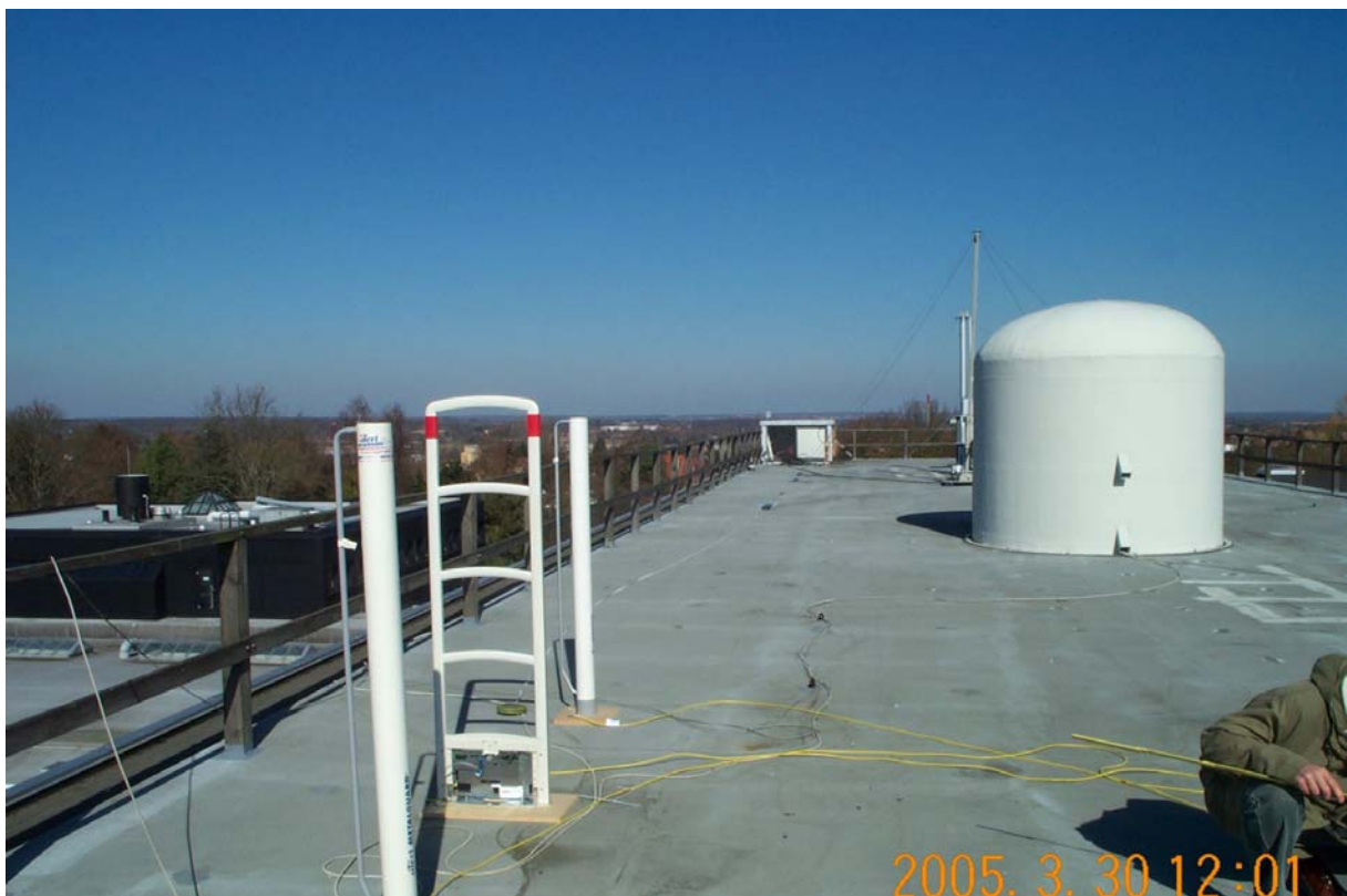
Photo 4 Radiated emission. 30 m OATS.