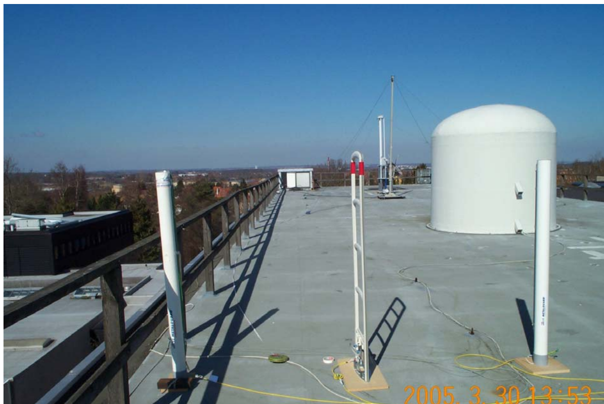
Photo 5 Radiated emission. 30 m OATS.