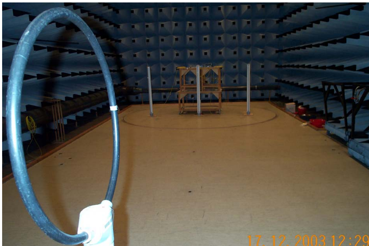
Photo 6 Test set-up during exploratory measurements