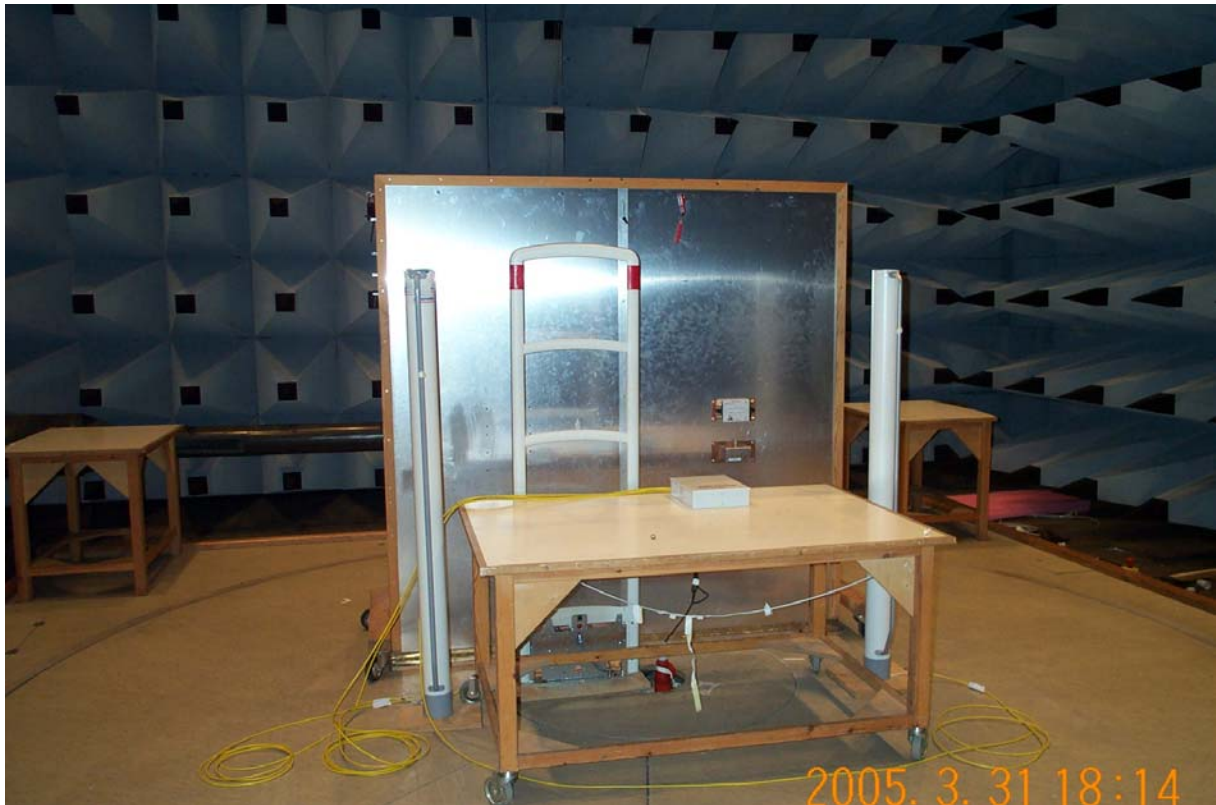
Photo 3 Conducted emission, 0.15 - 30 MHz.