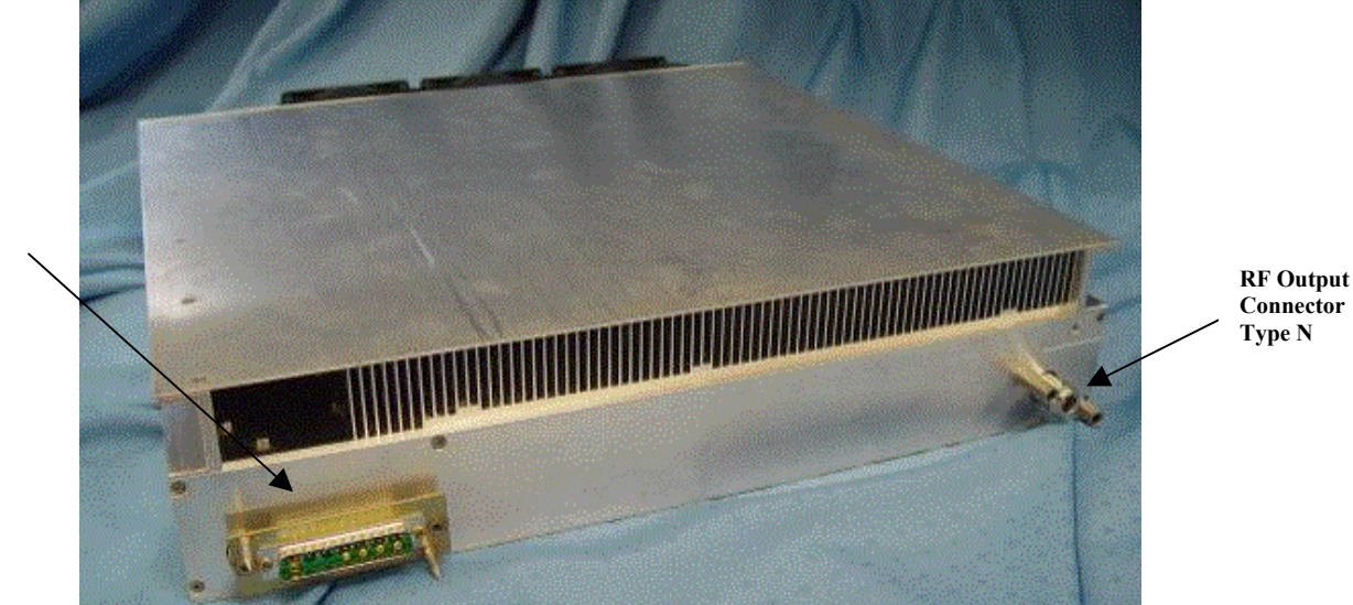
Figure 2 MSA1900-135 Rear Panel Andrew Wireless Solutions Propriety – Use pursuant to Company Instruction

DC/Control/RF input Connector 24W7 Combo D-Sub