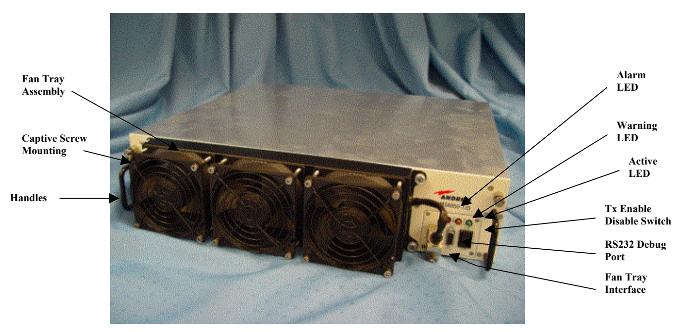
Figure 3 MSA850-135 MCPA Front Panel