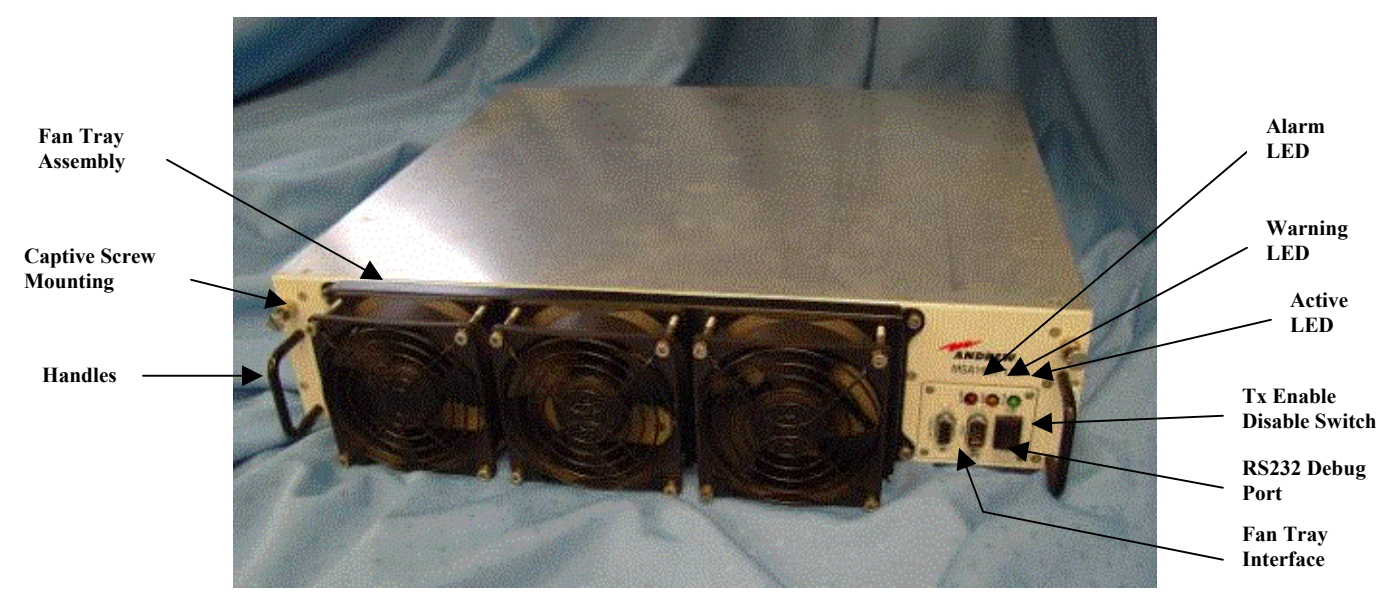
Figure 1 MSA1900-135 MCPA Front Panel

A microprocessor controller is used to control the amplifier alarm system, control environmental compensation of the amplifier, and to maintain a linearization solution for the pre-distortion circuit and the feed-forward circuit.