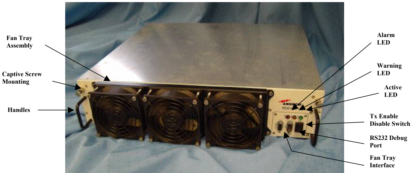
Figure 1 MSA1900-135 MCPA Front Panel

A microprocessor controller is used to control the amplifier alarm system, control environmental compensation of the amplifier, and to maintain a linearization solution for the pre-distortion circuit and the feed-forward circuit.