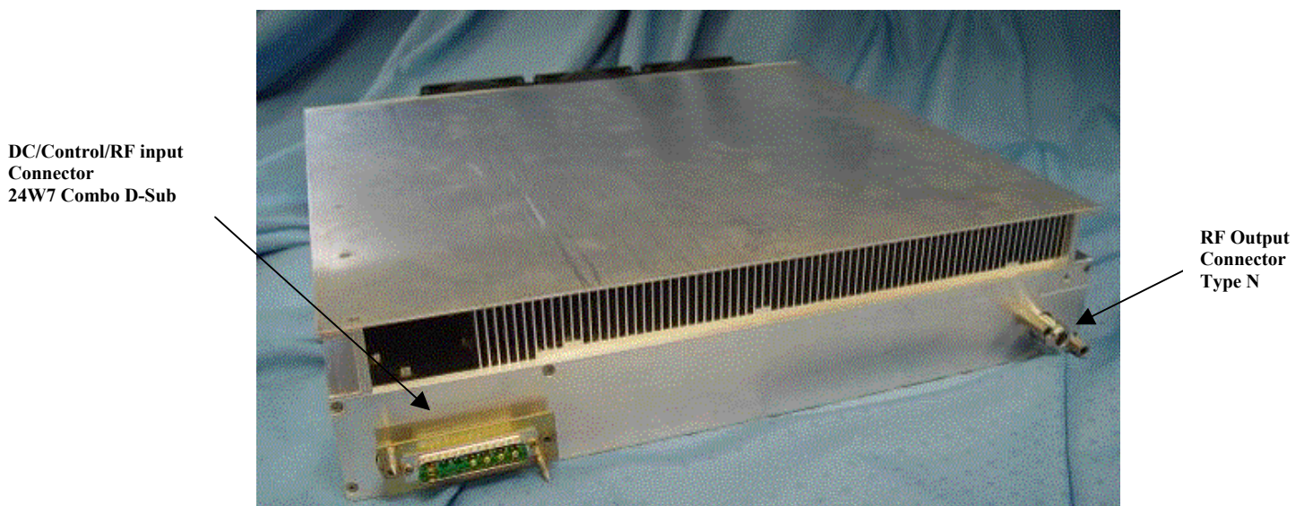
Figure 2 MSA1900-135 Rear Panel