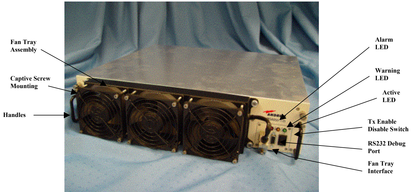
Figure 3 MSA850-135 MCPA Front Panel