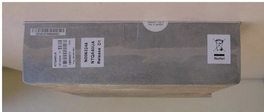
Figure 4 HePA1900 V3 rear view