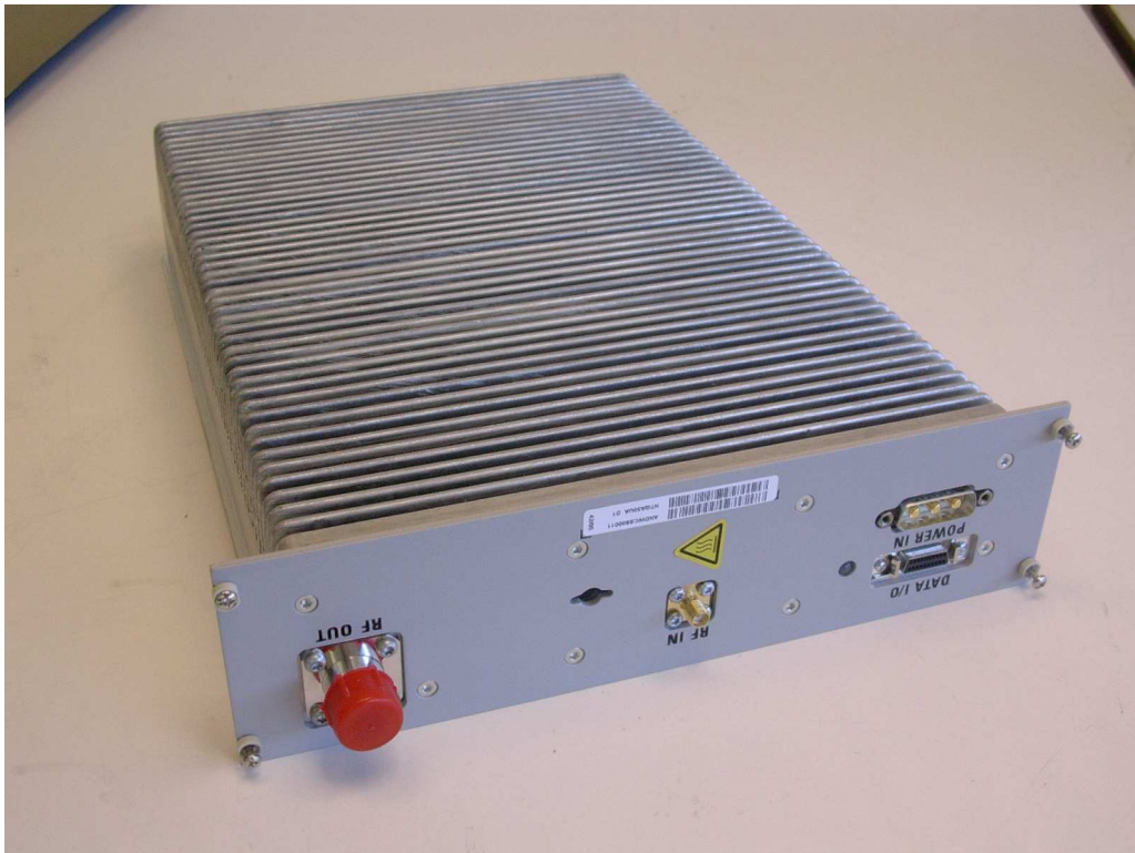
Figure 1 HePA1900 V3 overview

This document presents pictures of the Andrew Corporation 1900 Band HePA (High Efficiency Power Amplifier) amplifiers. The HePA1900 V3 amplifier is a high power, RF amplifier intended to provide signal amplification and conditioning. The HePA1900 V3 amplifier is compatible with GSM and EDGE air interfaces operating in U.S. domestic cell sites where FCC compliance is mandatory.