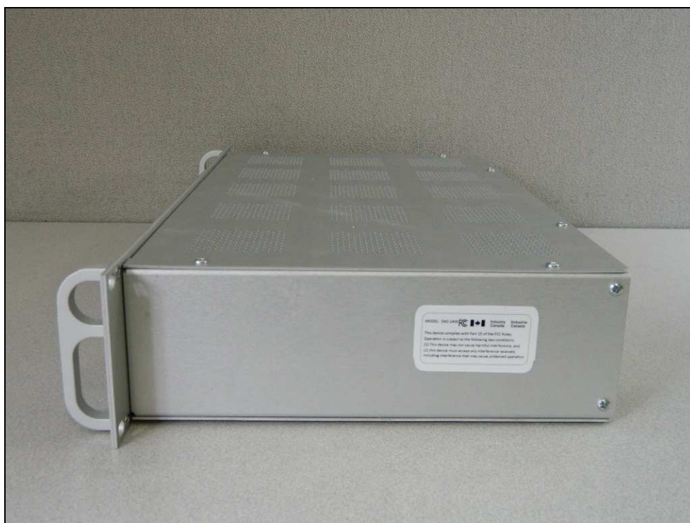
Figure 2: Sample Label Location - DAS2400 antenna distribution chassis