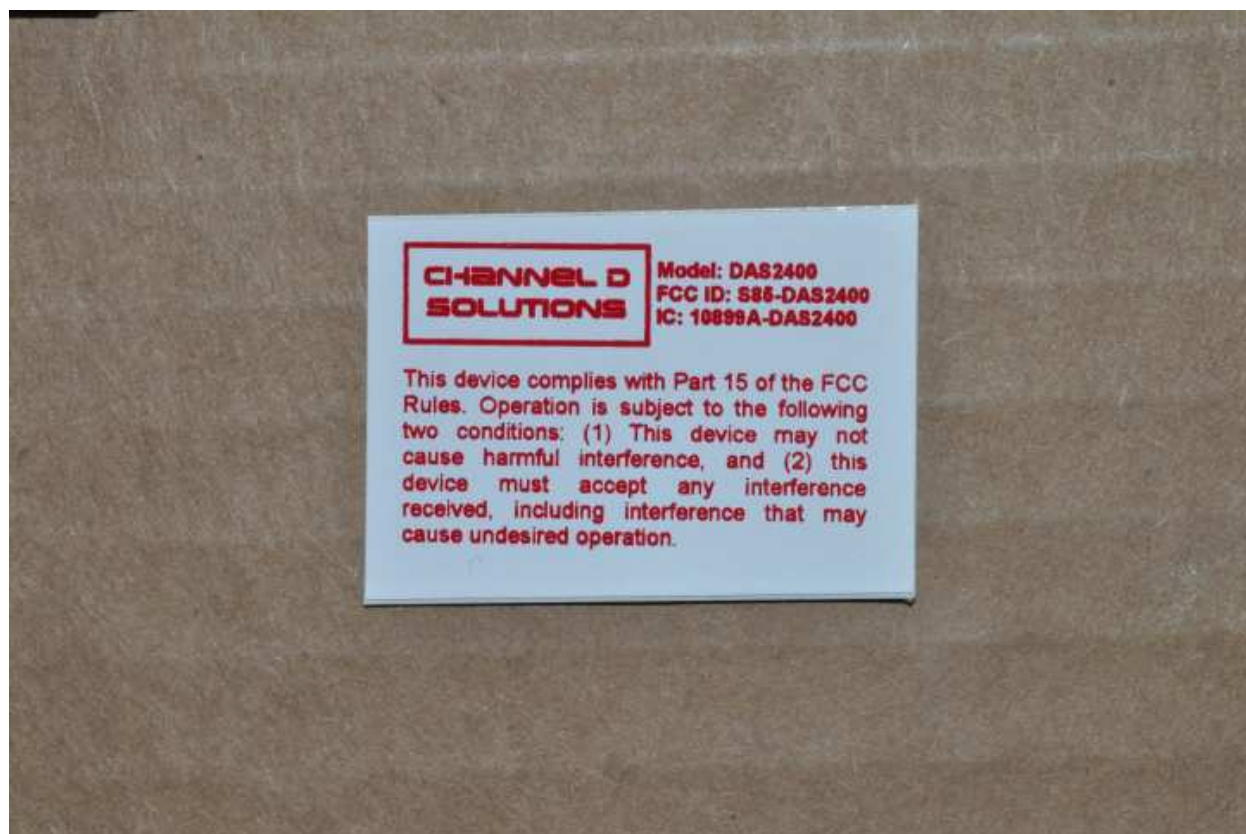
Figure 3: Sample Label – Label affixed to the DAS2400 RF Module