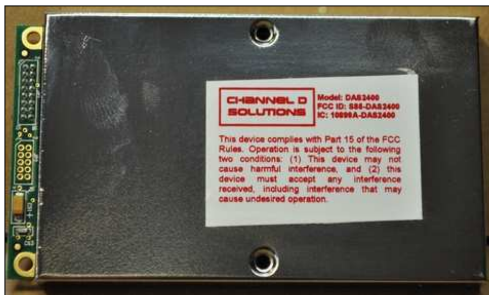
Figure 4: Sample Label Location - DAS2400 RF Module