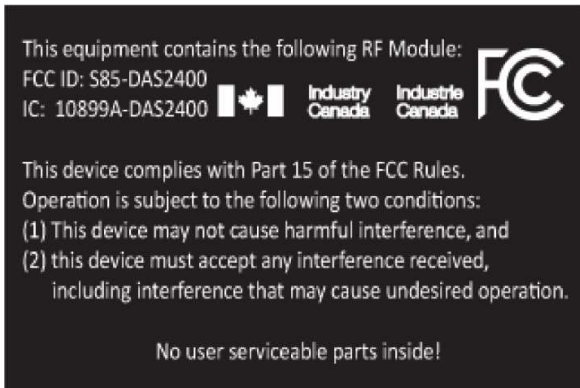
Figure 5: Sample Label – Label affixed to host equipment containing DAS2400 RF Module