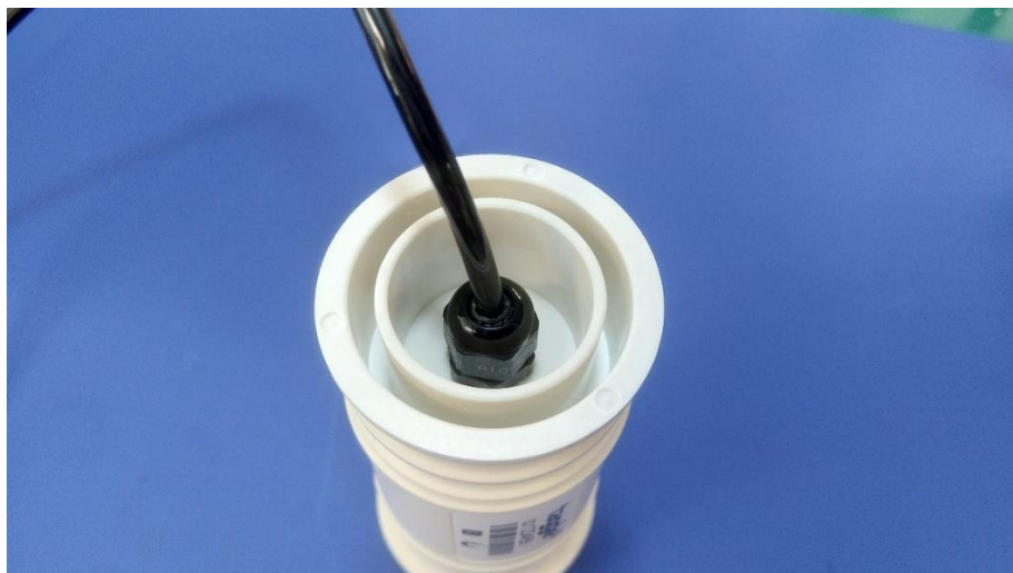
Figure 6: LORIKEET base detail

Note that a provision has been made in the base of the LORIKEET device housing that accepts 32 mm (1 ¼ inch) OD conduit or similar. This can be utilised if cable protection is required.