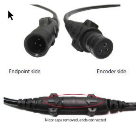
Figure 2: Nicor AMR-III connector detail