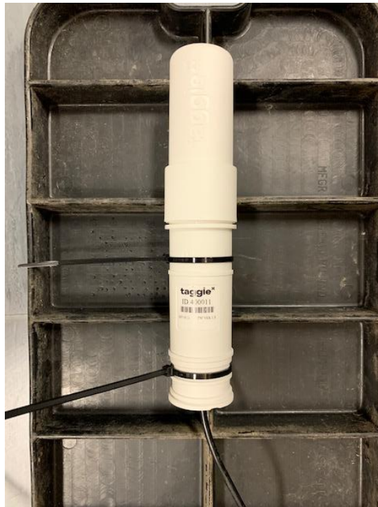
Figure 5: Trim excess cable ties length and discard appropriately