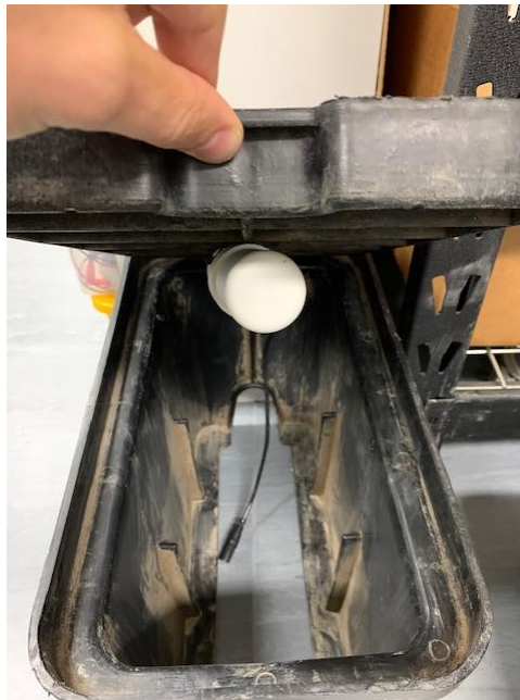
Figure 3: shows LORIKEET with Antenna positioned closest to lid opening point