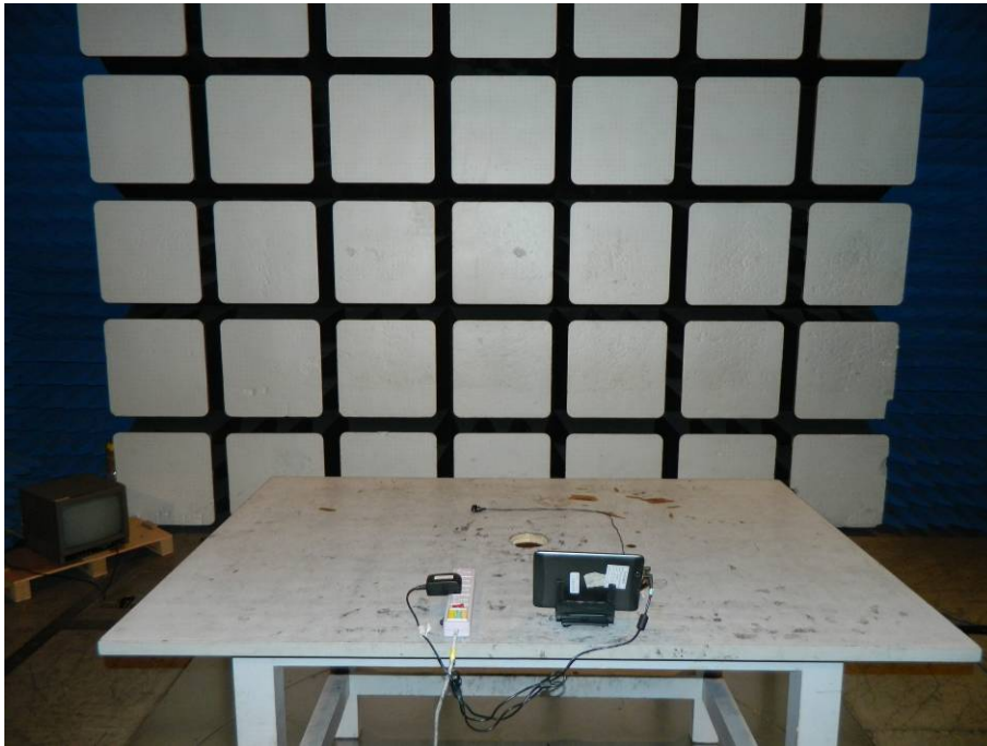
Conducted Measurement Photo