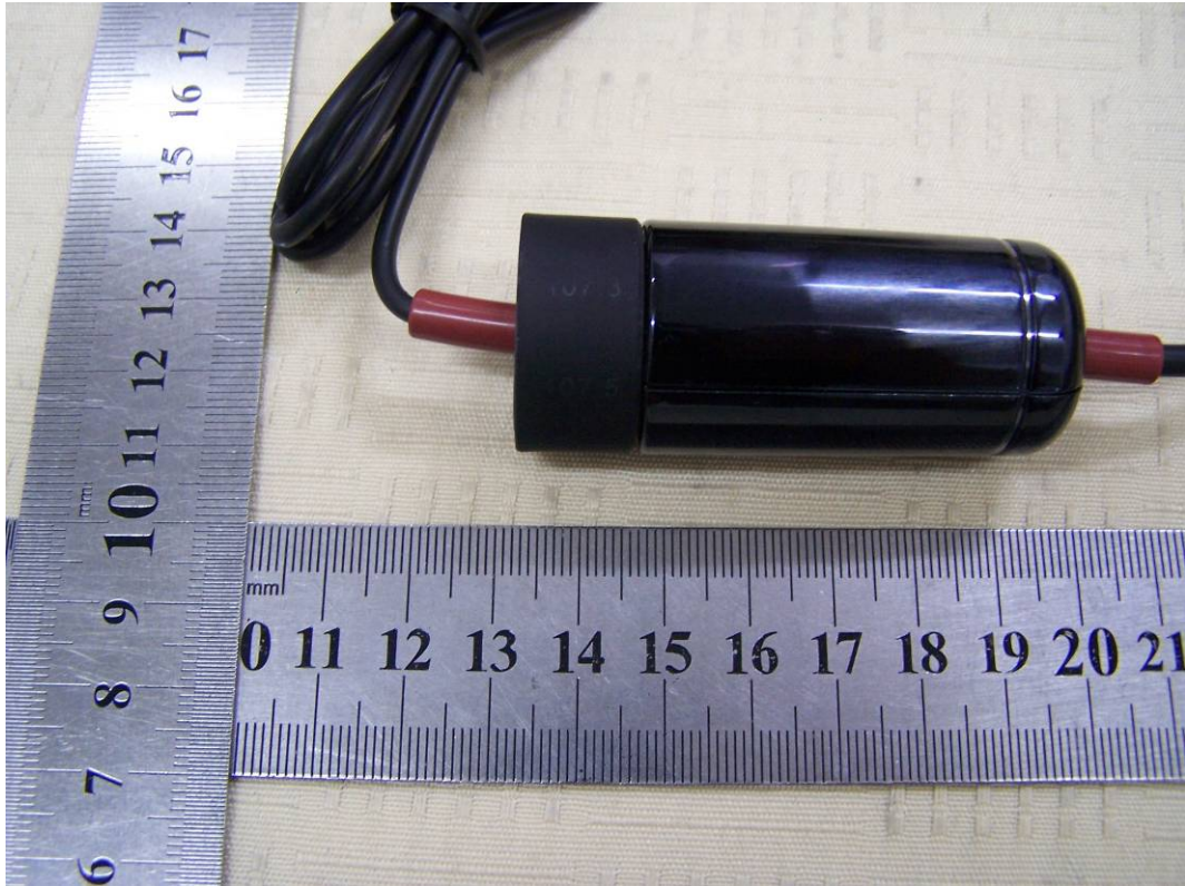
Photo of DC Charger