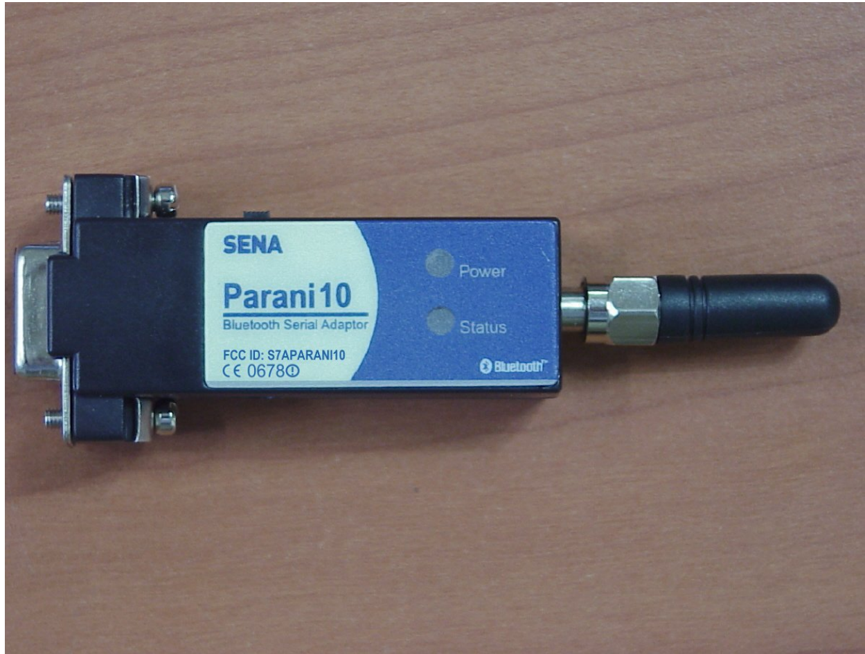
<Photograph 1: Front View>