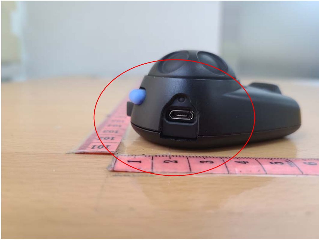
USB Port 2 (Speaker and Mic port)