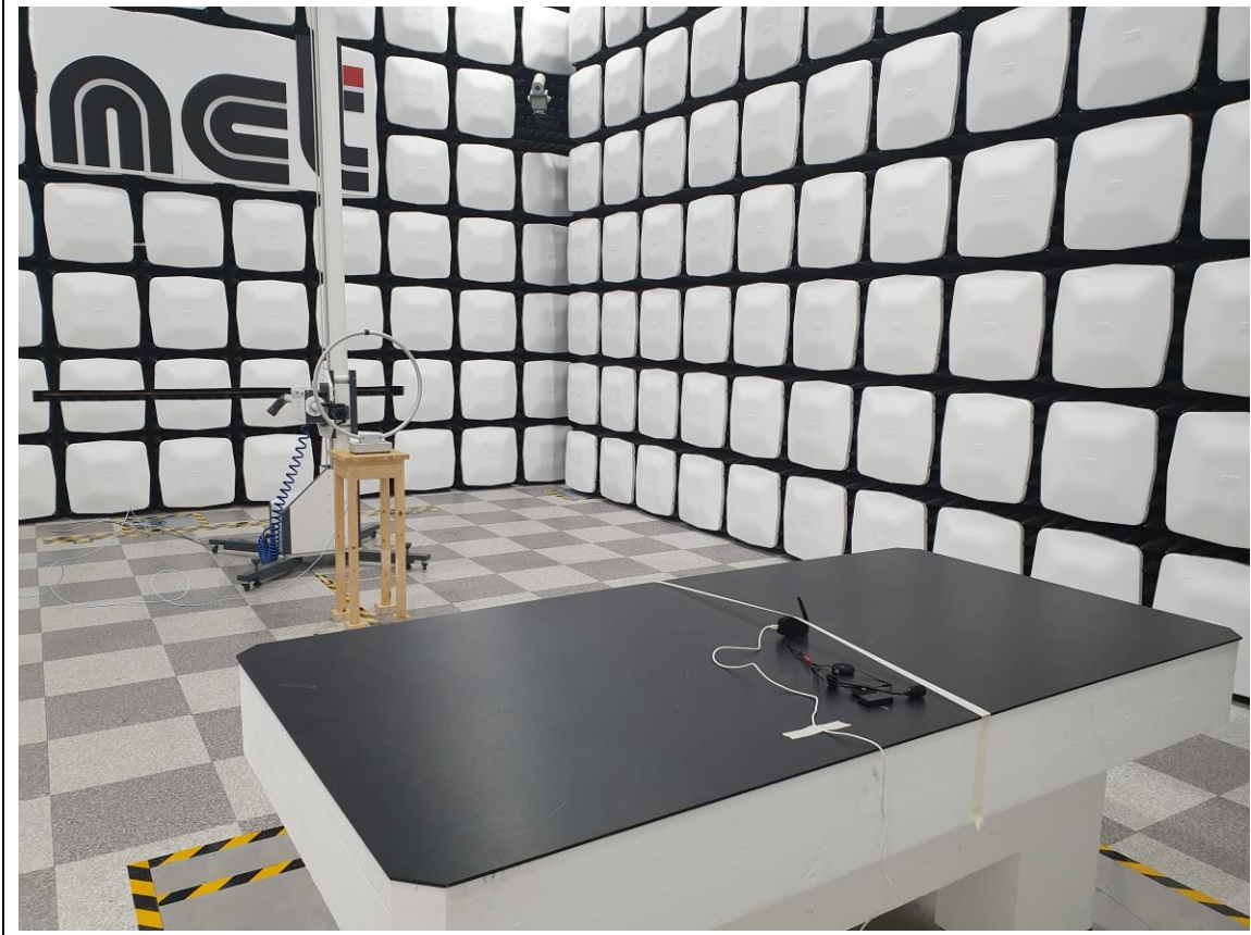
Below 30 MHz