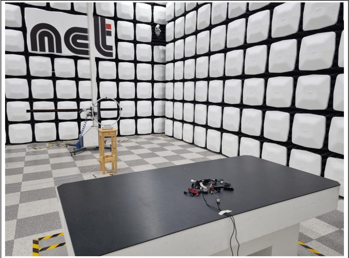
Below 30 MHz