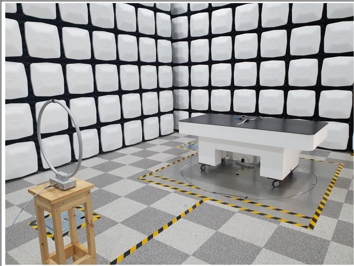
Below 30 MHz