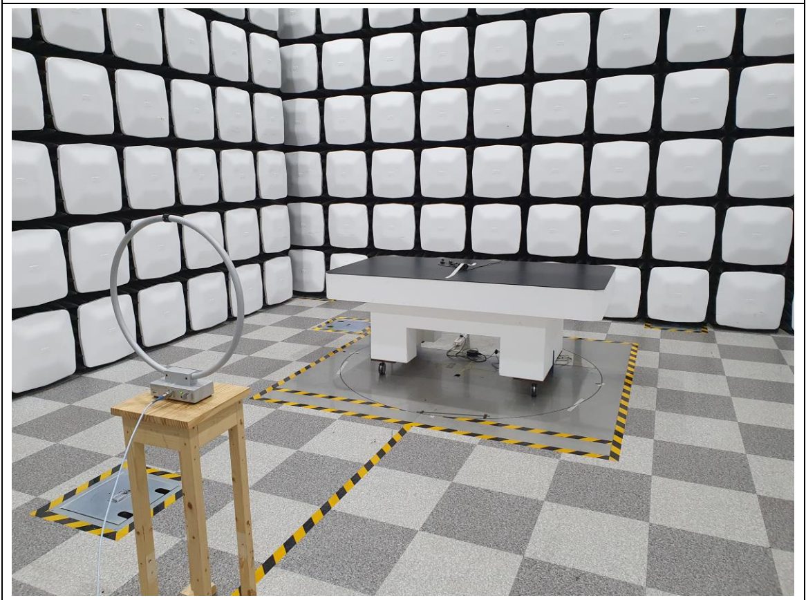
Below 30 MHz