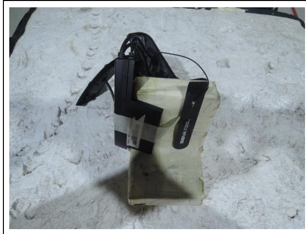
EUT Position: Z-axis