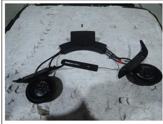
EUT Position: Y-axis