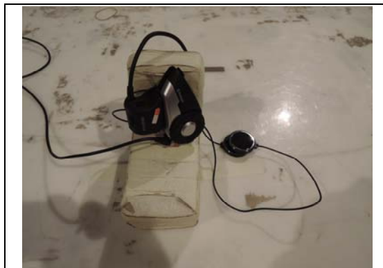
EUT Position: Z-axis