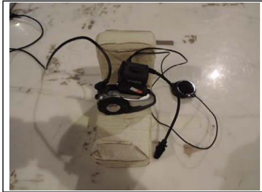
EUT Position: Y-axis