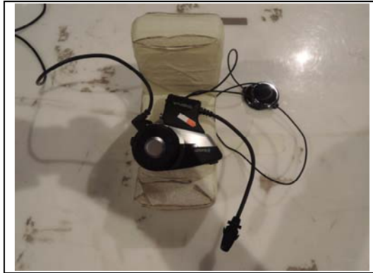
EUT Position: X-axis