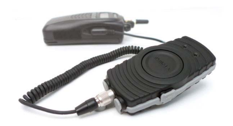
SR10 Bluetooth® Two-way Radio Adapter