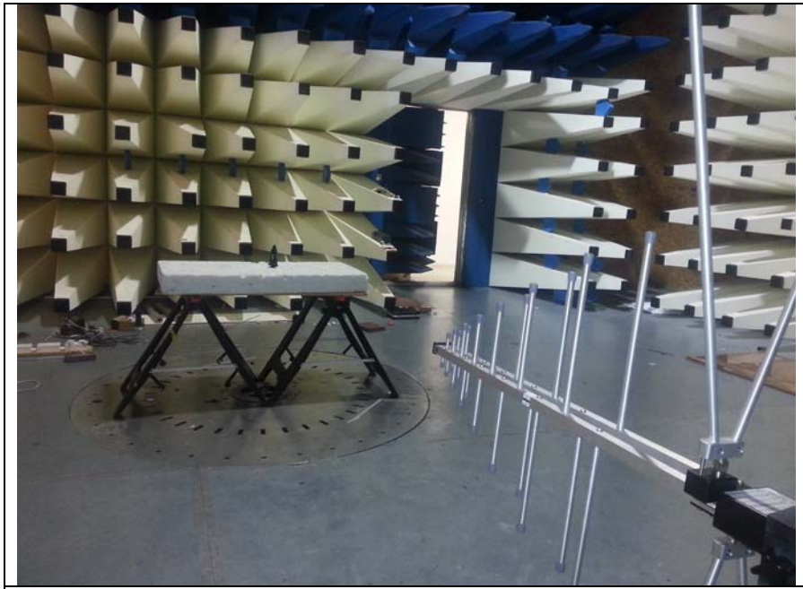
Fig 1 Test setup 30MHz -300MHz Rad Emissions