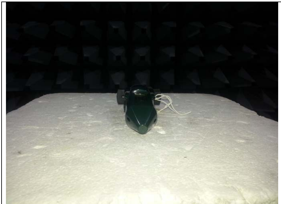
Fig 4 Test setup Rad Emissions