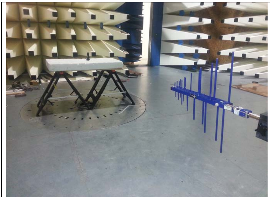
Fig 2 Test setup 300MHz -1GHz Rad Emissions