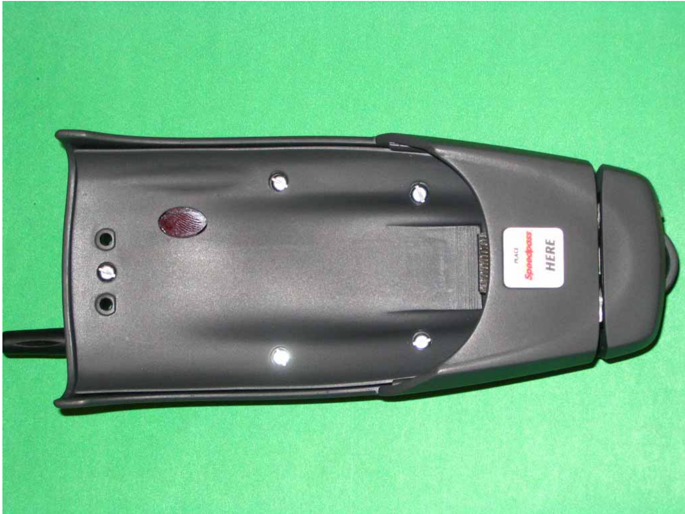
Figure 2: Front Side With Symbol PDA Removed