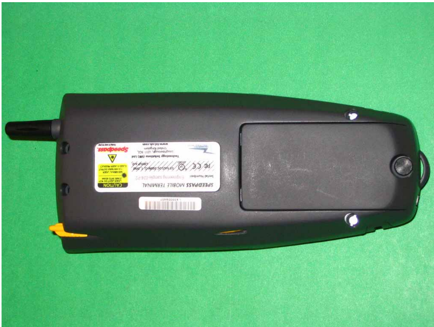
Figure 3: Back Side of Test Sample