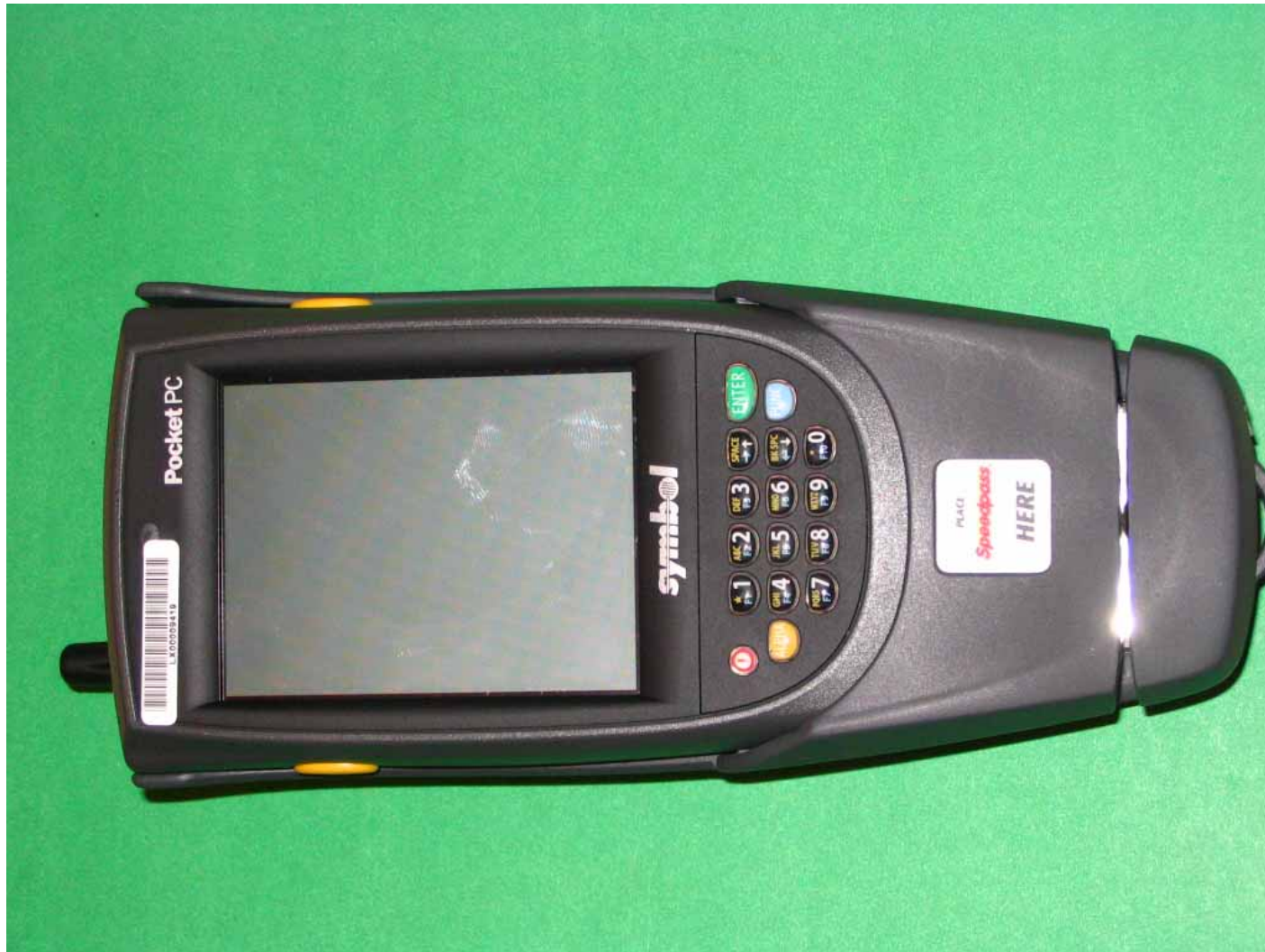
Figure 1: Front Side With Symbol PDA Installed