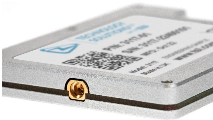
Figure 3 – MMCX port for antenna connection

The 3N1X module is compatible with many different antennas however, regulatory approvals for the module only apply to specific antenna types as described in the Third-Party Integration Regulatory Requirements section, below.