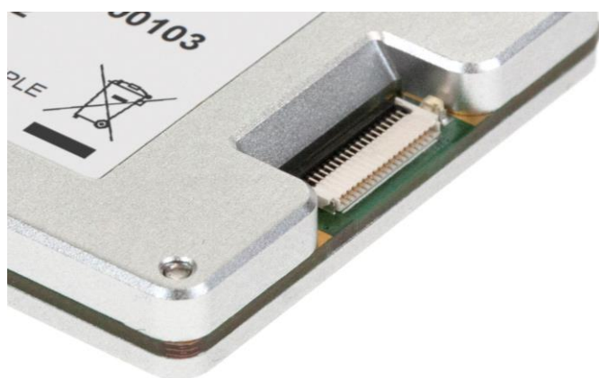
Figure 2 – The FPC connector

See TABLE 1 – FPC CONNECTOR PIN FUNCTIONS for details