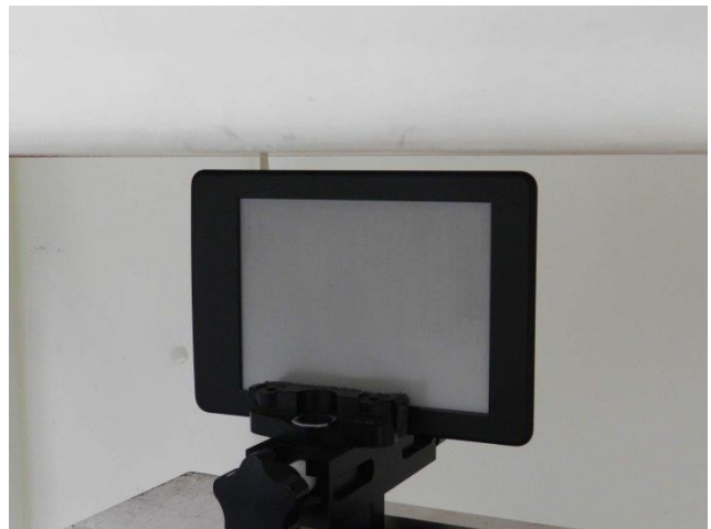
Edge4, Test Separation 0.5 cm