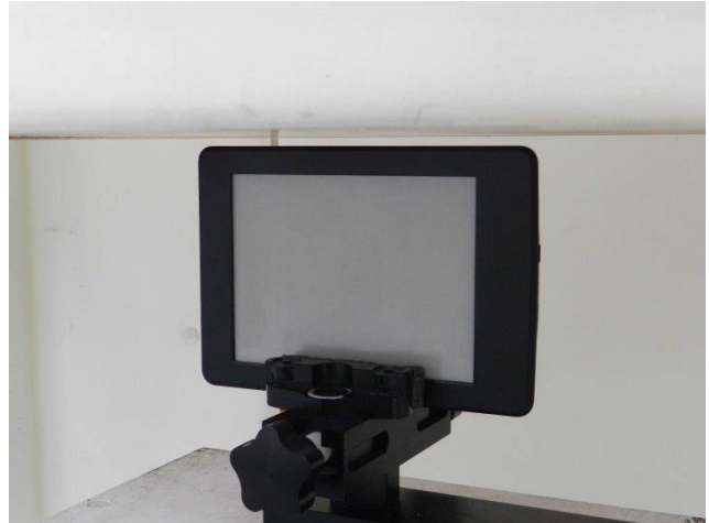
Edge2, Test Separation 0.5 cm