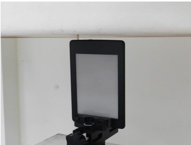
Edge3, Test Separation 0.5 cm