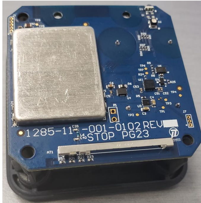
BLUrepeater V1 PCB Installed in Enclosure