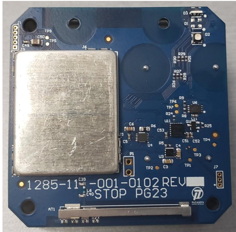
Top of BLUrepeater with Shield Installed