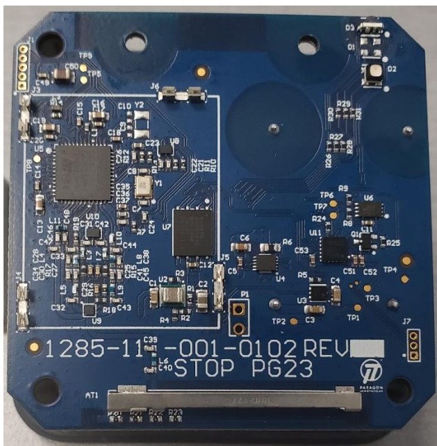
Top of BLUrepeater V1_PCB