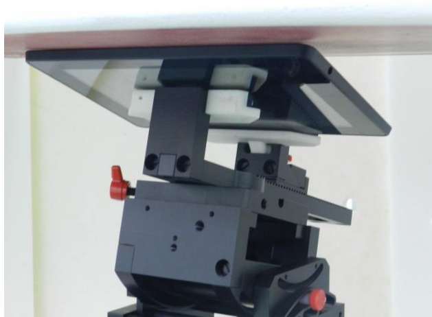
Bottom Face-Slant of Edge1, Test Separation 0 cm