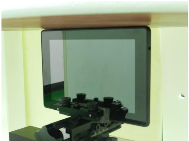
Edge1, Test Separation 0 cm