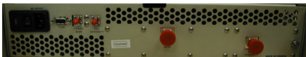
Figure 3.4: iPA Rear View (AC input Power) (-48v DC version also available)