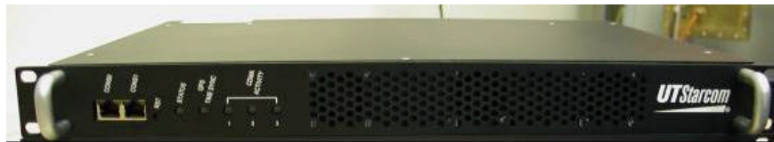
Figure 3.2: BTS 19" Rack Mount Front View