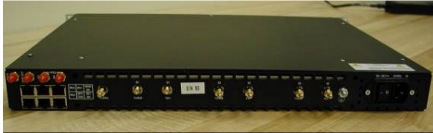
Figure 3-1: BTS 19" Rack Mount Rear View