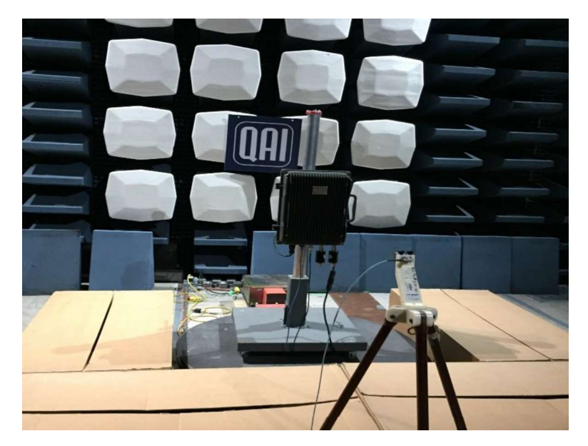
Figure 5: Radiated Emissions above 18GHz