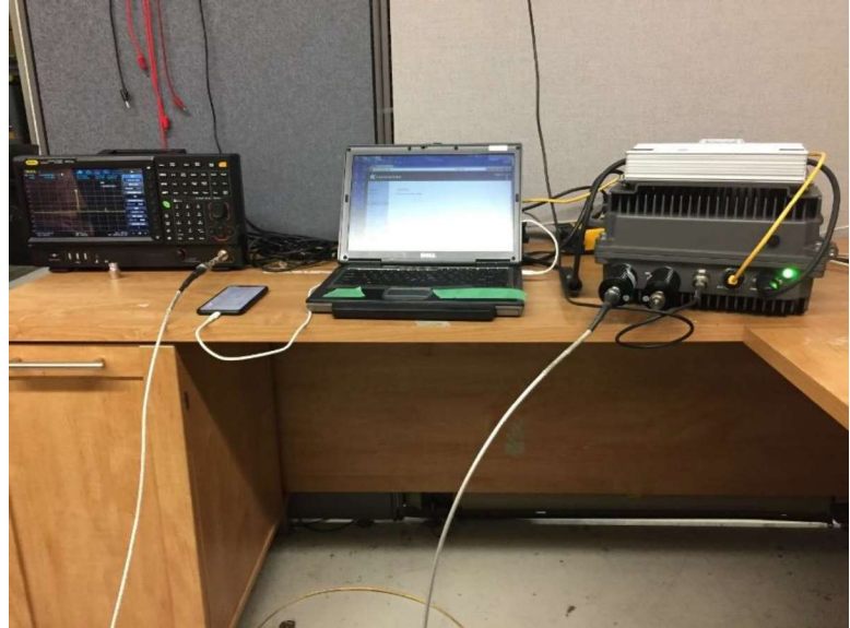
Figure 7: Radio Testing Station