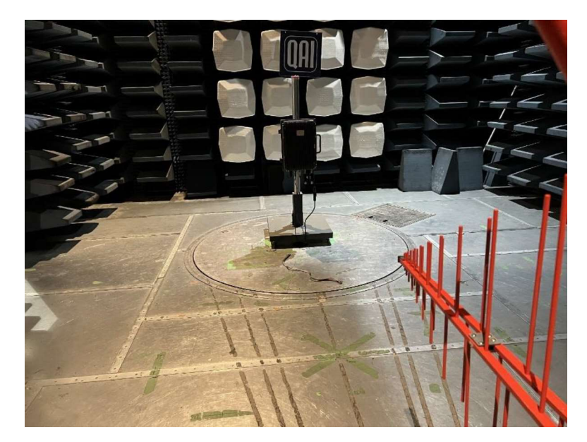
Figure 3: Radiated Emissions 30MHz. – 1GHz.