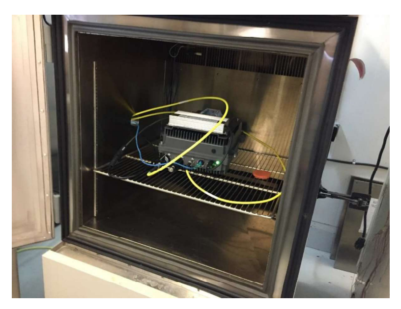
Figure 6: Frequency Stability Testing