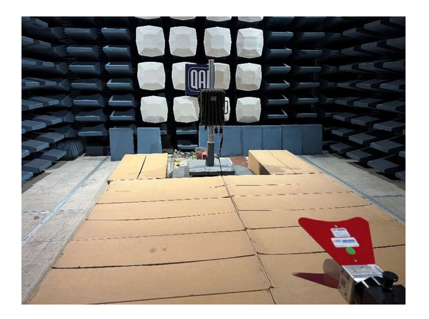
Figure 4: Radiated Emissions 1GHz to 18 GHz