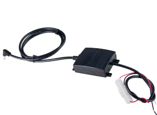
DCH6i: DC 6V Power Supply; Install type