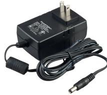
DCH6HV: AC/DC Wall 6V Power supply