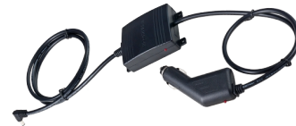
DCH6Csw: DC 6V Power Cigar Socket type Adapter

To comply with FCC rules, this booster must only be operated with cables, antennas and coupling devices that have been approved for use with this equipment