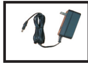
AC/DC Power Supply (Optional) Allows Use of Booster In Home Or Office