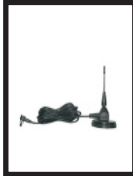
Dual Band 2"Mag Mount Antenna