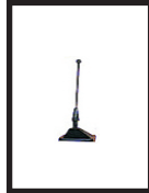
Dual Band Glass Mount 2" Antenna