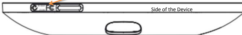
Side of the Device