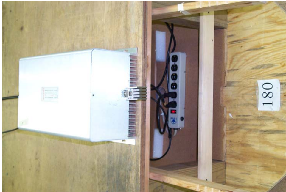
Configuration I: Front View