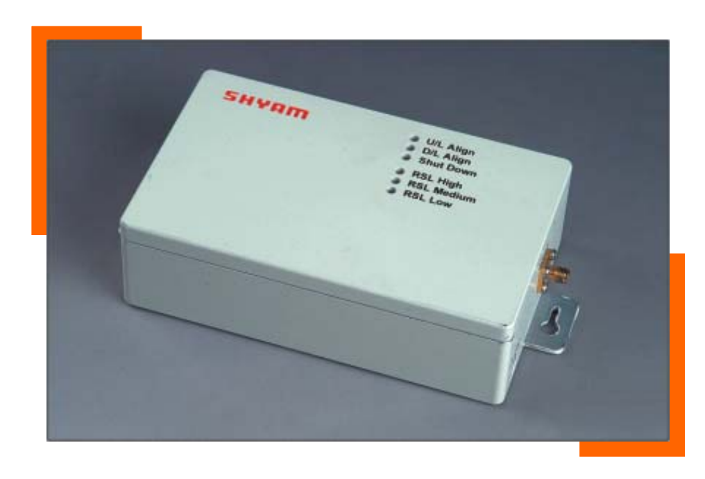
HB-20 Home Booster 1900 MHz