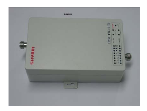
DBHB-20 Dual Band Home Booster 800 & 1900 MHz