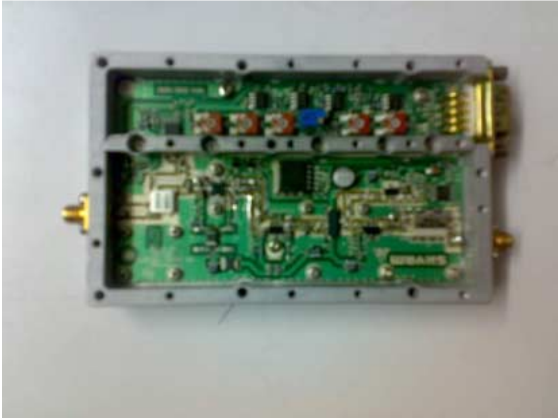
PA PCB View