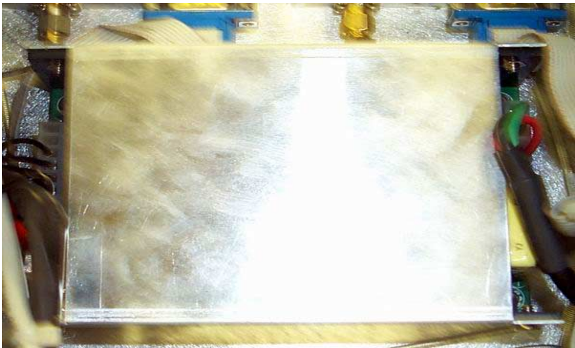
Duplexer & PS View