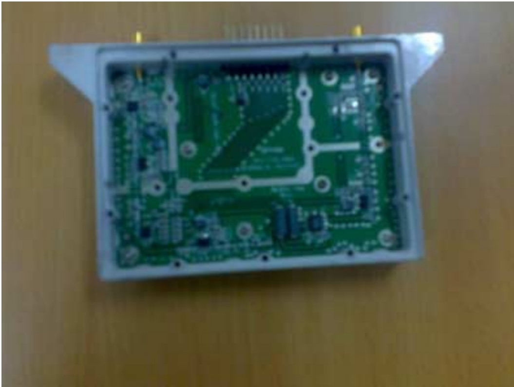
Converter PCB View