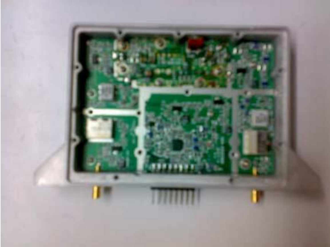
LNA PCB View