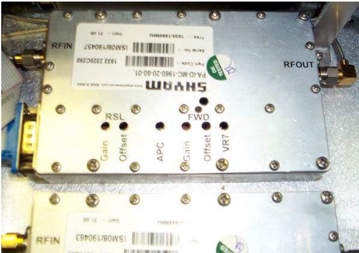
Converter & PA View