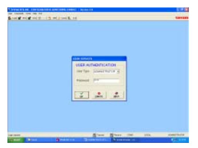
Figure 4: Login Repeater

The system is delivered with software loaded in order to perform configuration as per requirement. It also enables monitoring the status. Configuration of parameters can be carried out locally at MOU & DBROU with the help of laptop / PC connected to the system by means of local USB serial interface or remotely via wireless modem (Optional) mounted inside the MOU. The laptop/PC should be loaded with the CMC software available on the supplied CD along with the USB driver.