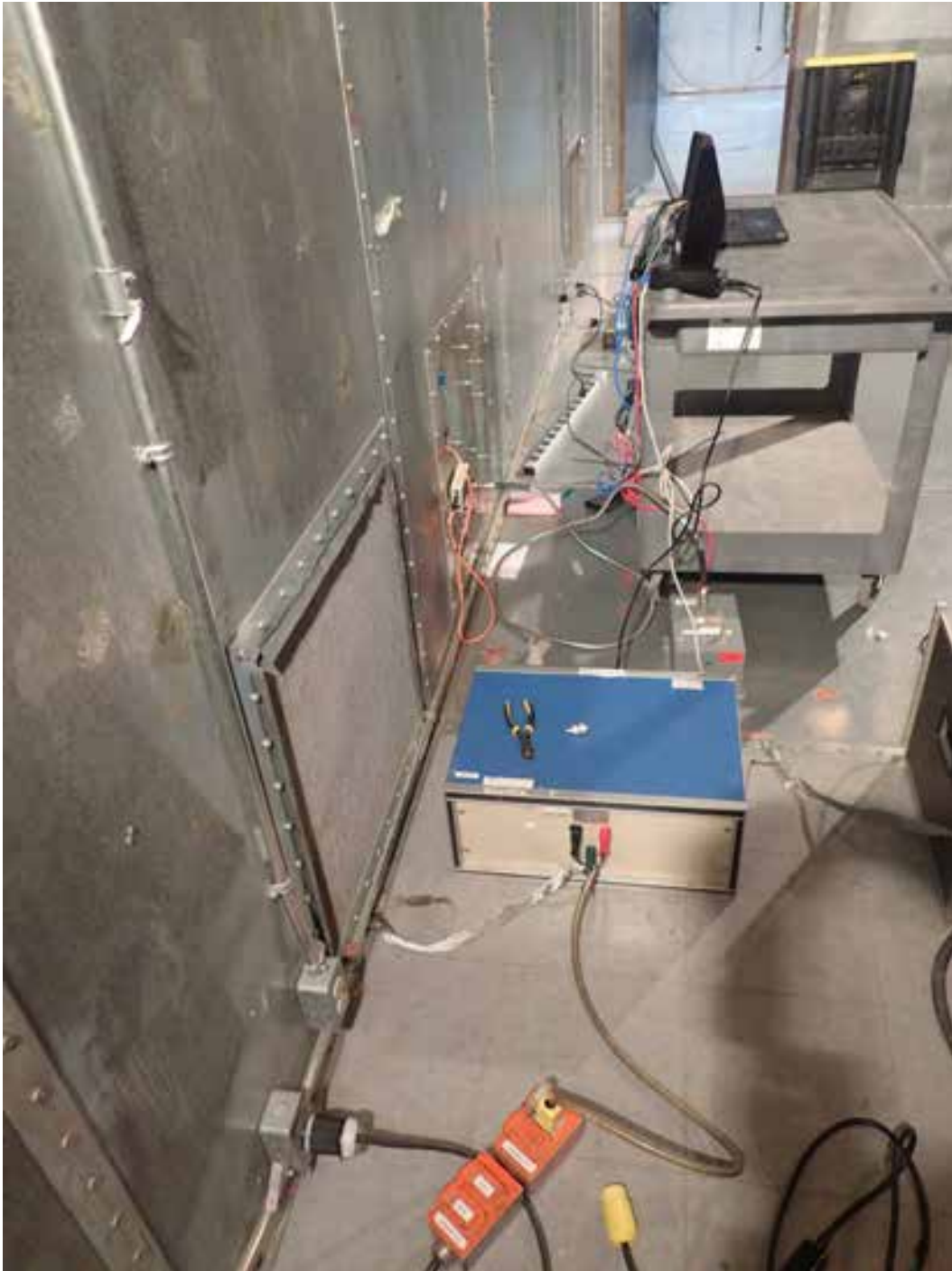
Power Line Conducted Emissions (EUT Powered by PoE Injector Power over Ethernet)