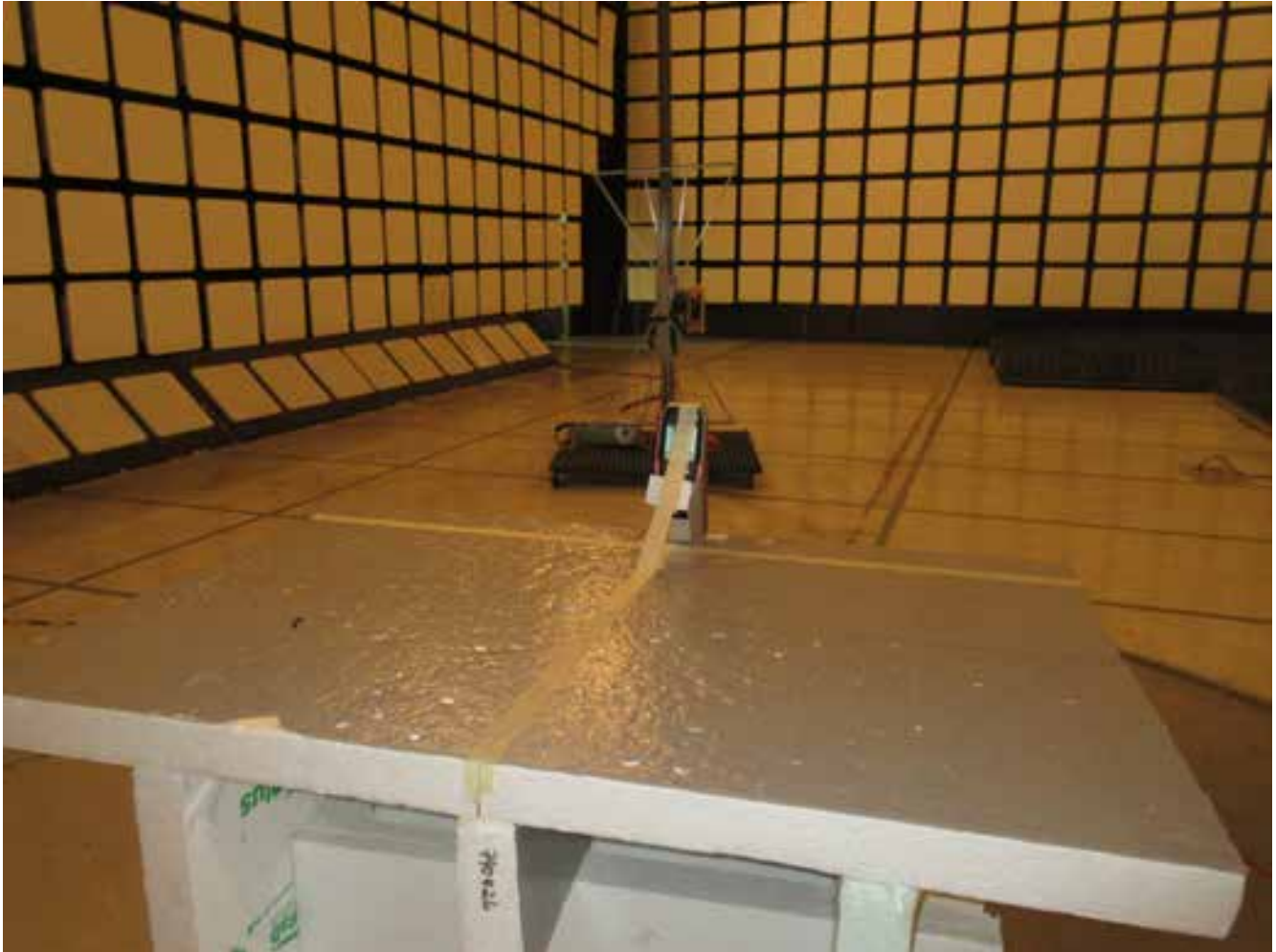
Radiated Emissions at 3 m Distance (30-1000 MHz)