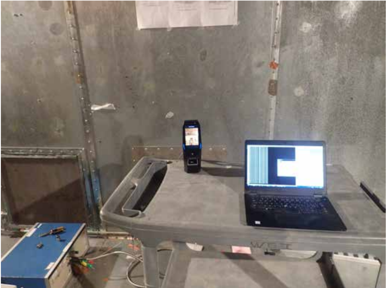
Power Line Conducted Emissions (EUT Powered by External DC Power Supply)