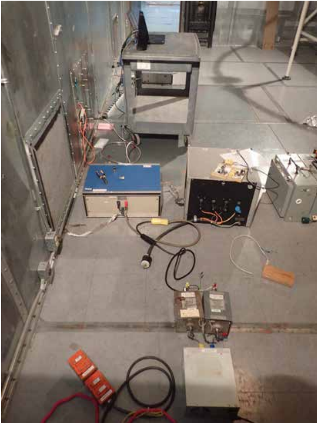
Power Line Conducted Emissions (EUT Powered by External DC Power Supply)