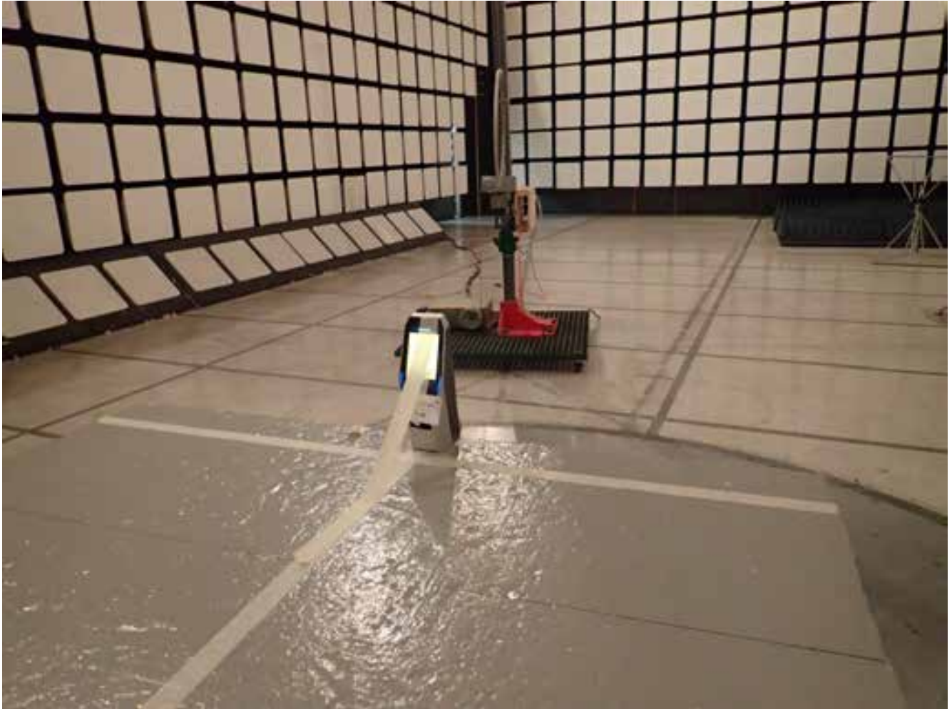
Radiated Emissions at 3 m Distance (for frequencies below 30 MHz)