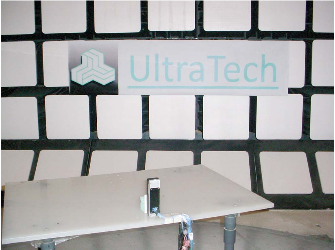
Radiated Emissions at 3m Distance