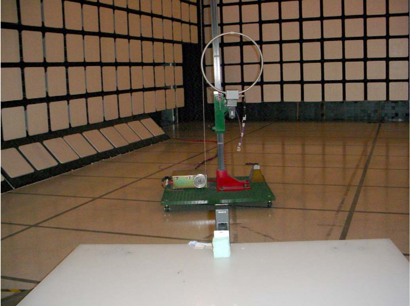
Radiated Emissions at 3m Distance (for frequency below 30 MHz)