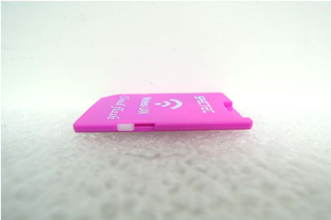
Side View of EUT – 4