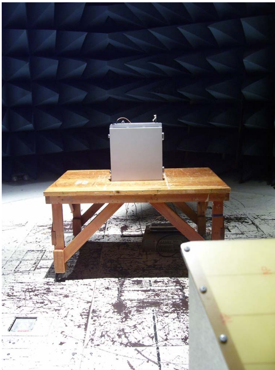
Photograph 5. EUT Test Setup for Part 24