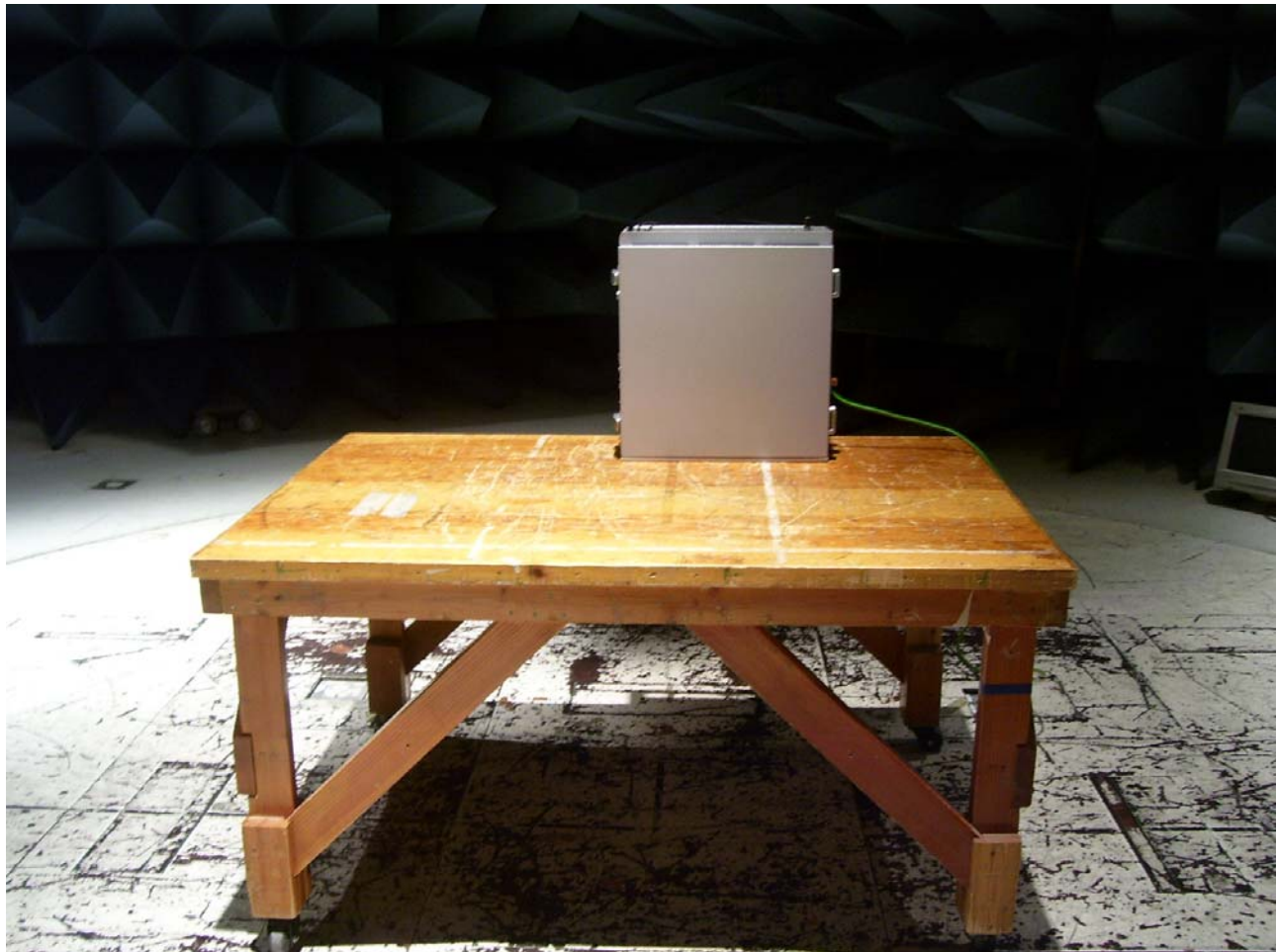
Photograph 4. Radiated Emission Limits, Test Setup