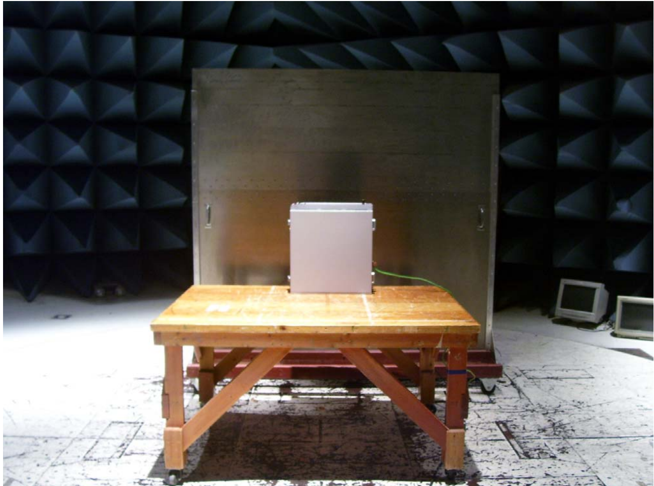
Photograph 2. Conducted Emissions Test Setup Photograph