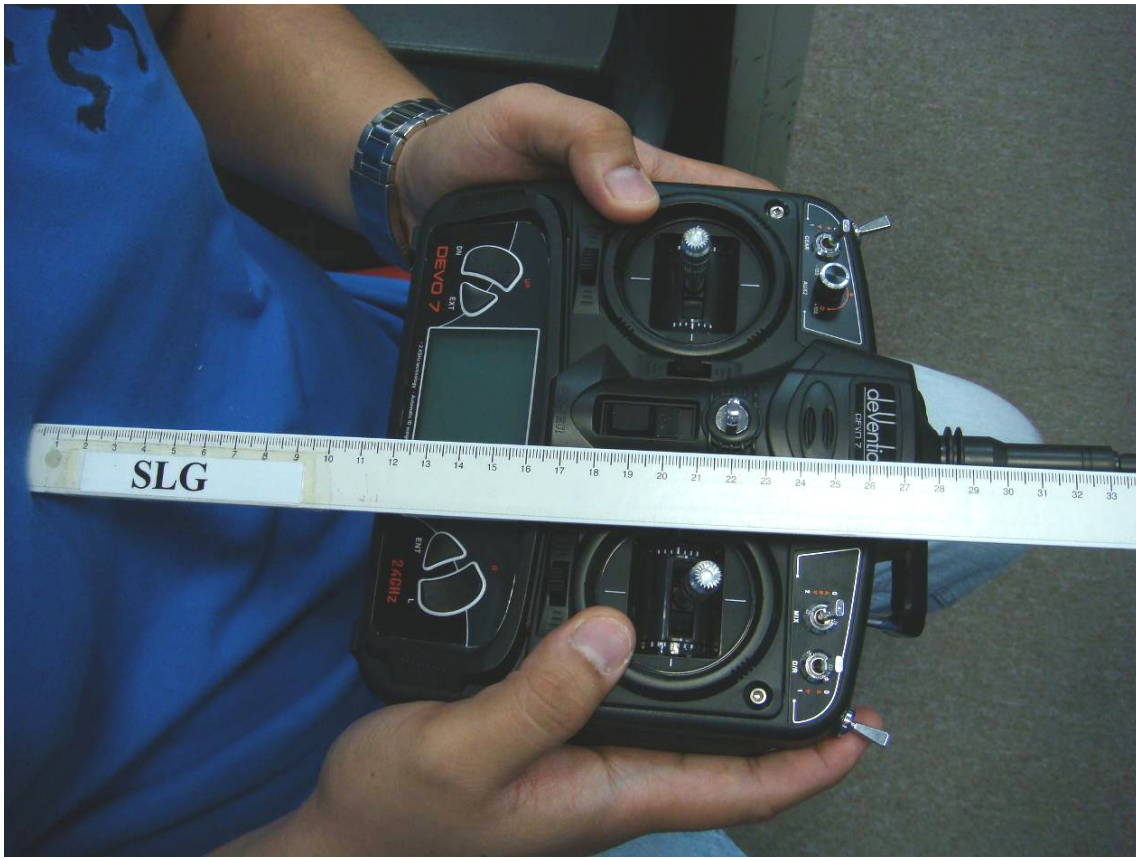
Picture1: Close to chest (28cm from antenna to torso) normal operation

The following picture demonstrate that this device meet the > 20cm Distance requirement in worst case operating conditions.