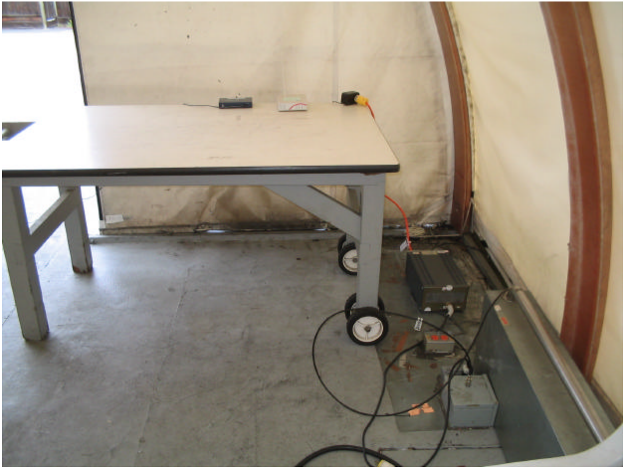
Figure 1: AC Conducted Emissions